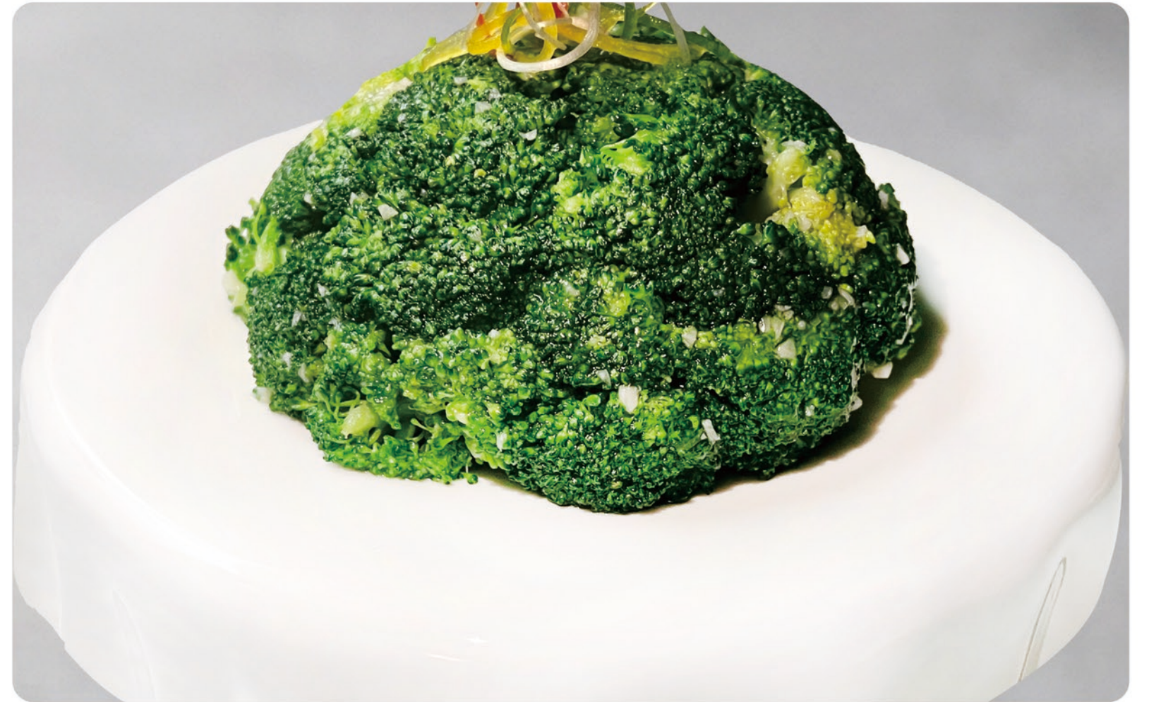
46 Garlic Broccoli €11.80 蒜蓉西兰花 西兰花, 大蒜 Broccoli with Garlic