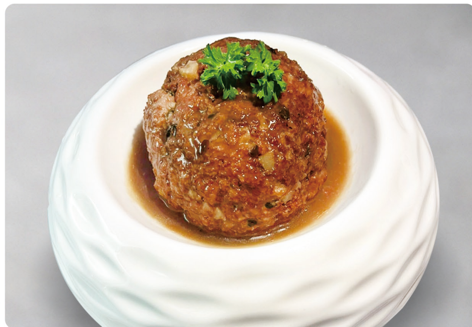
35 Meat Ball €12.80

Pork, Sliced Spring Onion, Cucumber with Bean Curd