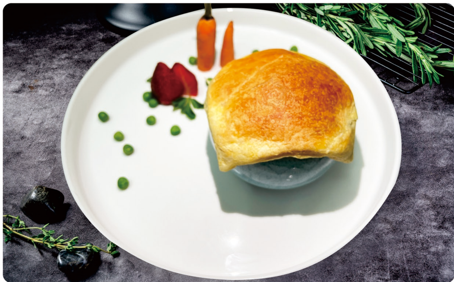
41 Beef Goulash €19.80 红烩牛肉 牛肉, 土豆, 番茄, 胡萝卜, 洋葱, 芹菜 Beef, Potatoes, Tomatoes, Carrots, Onion with Celery