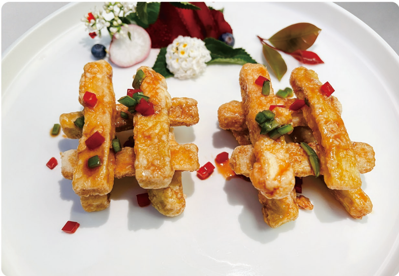
49 Glacier Eggplant (Aubergine) €14.80 冰川茄子 茄子, 彩椒 Eggplant (Aubergine) with Bell Pepper