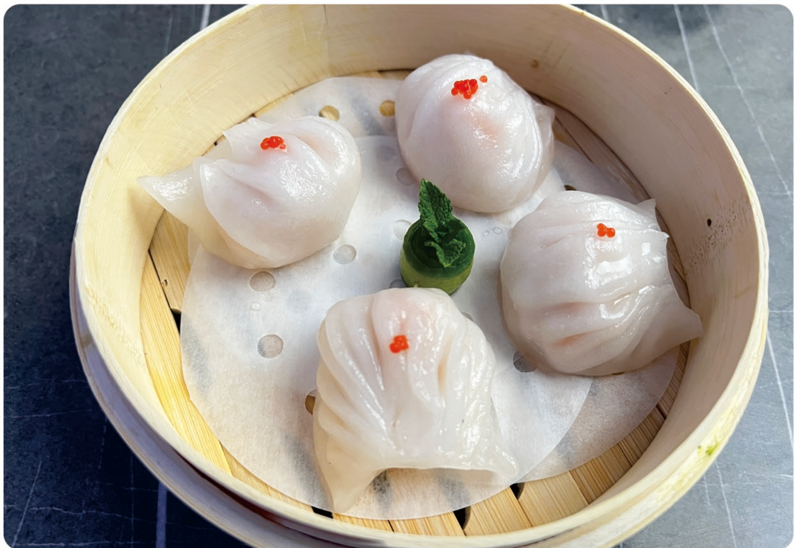
57 Crystal Shrimp Dumplings(Fresh Hand Made) €9.80 水晶虾饺(手工现制作) 虾仁, 鱼子酱 Shrimp with Caviar