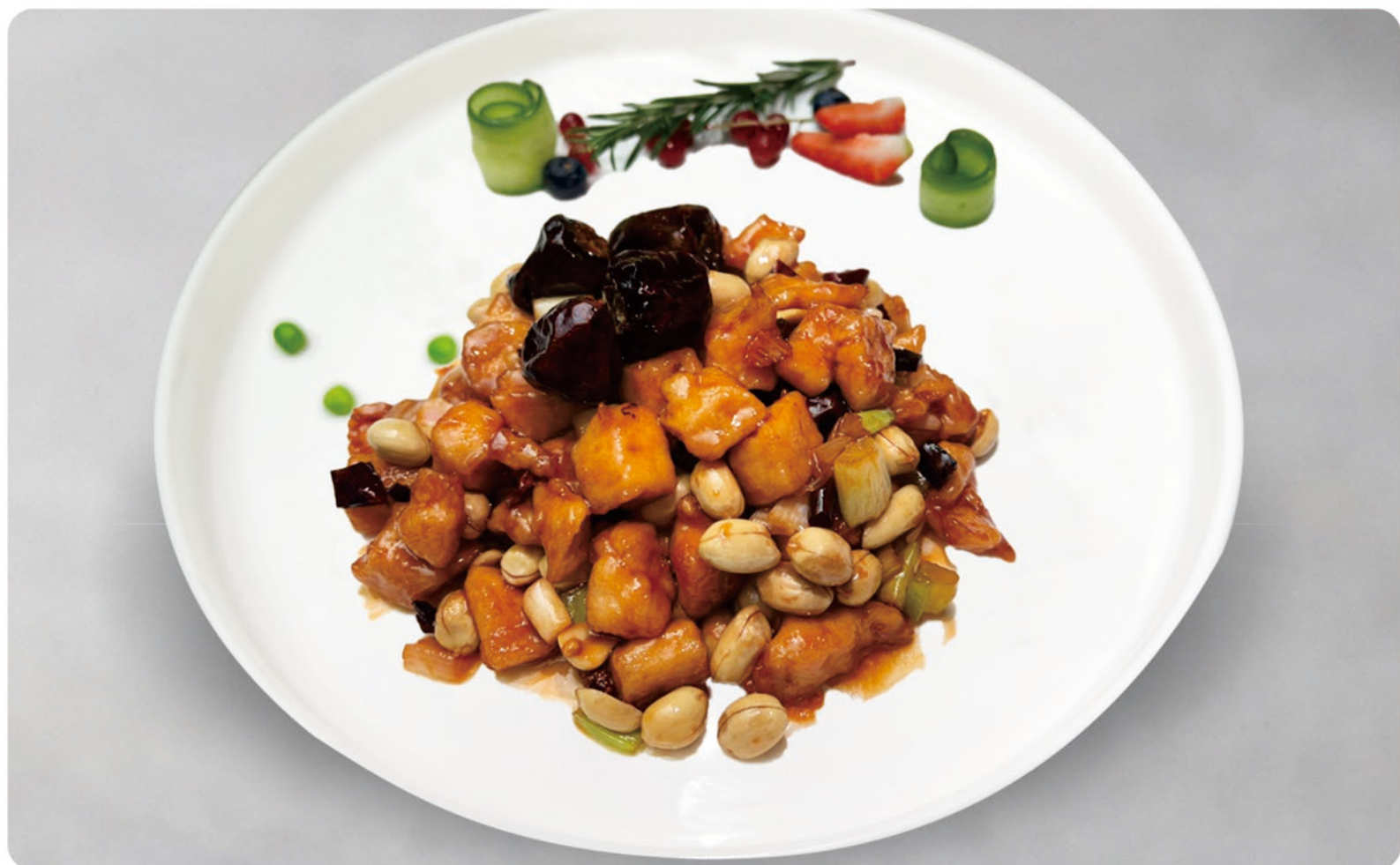
37 GongBao Chicken 🌶️ €14.80 宫保鸡丁 鸡肉, 干辣椒, 花生, 大葱 Chicken, Dried Chili, Peanut with Leek