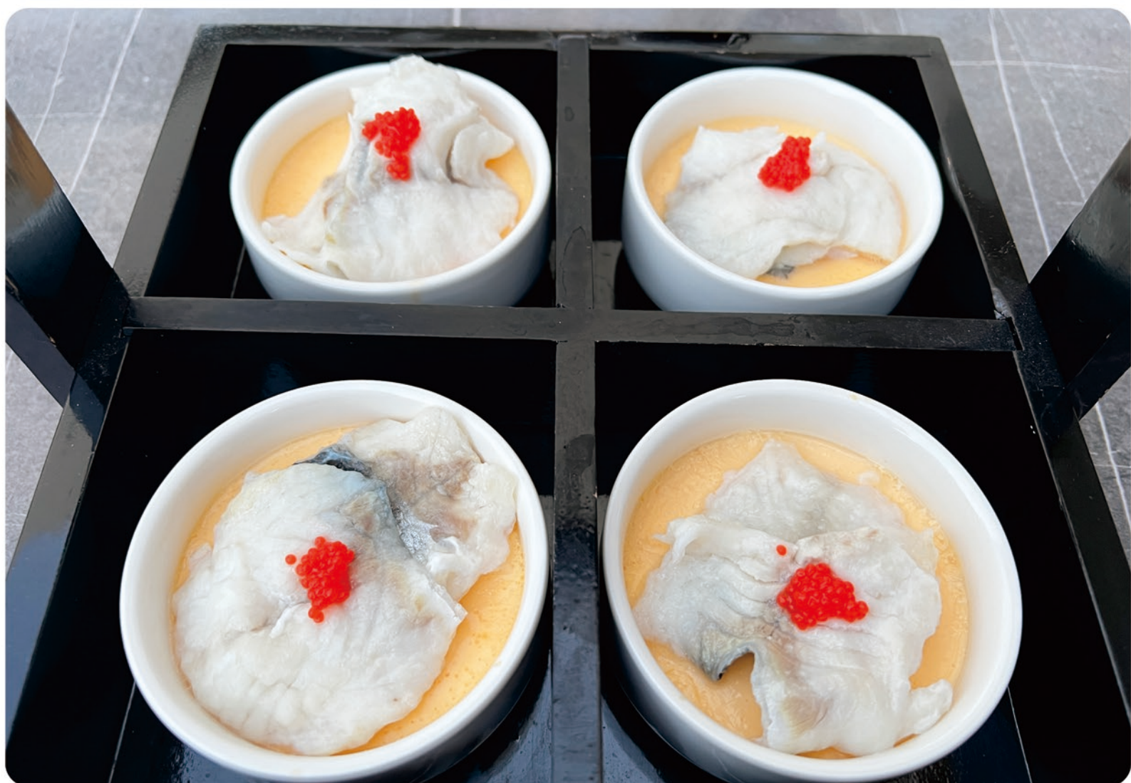
21.1 Sea Bass on Steamed Egg with Caviar €16.80 蛋底蒸鲈鱼配鱼子酱 鲈鱼, 鸡蛋, 鱼子酱 Sea Bass, Egg with Caviar