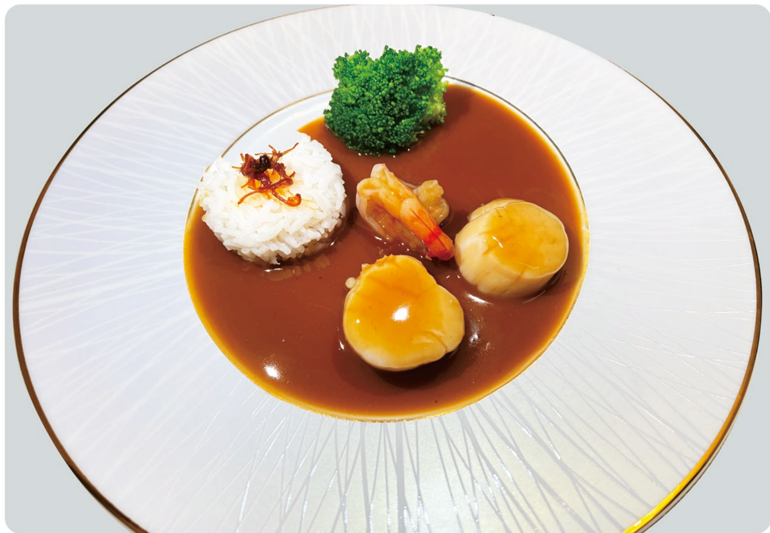
05 Scallops, Tiger Prawn, Abalone Sauce €19.80 鲍汁澳带配虎虾 澳带, 虎虾, 配上米饭和西兰花 Scallops, Tiger Prawn, Served with Rice and Broccoli