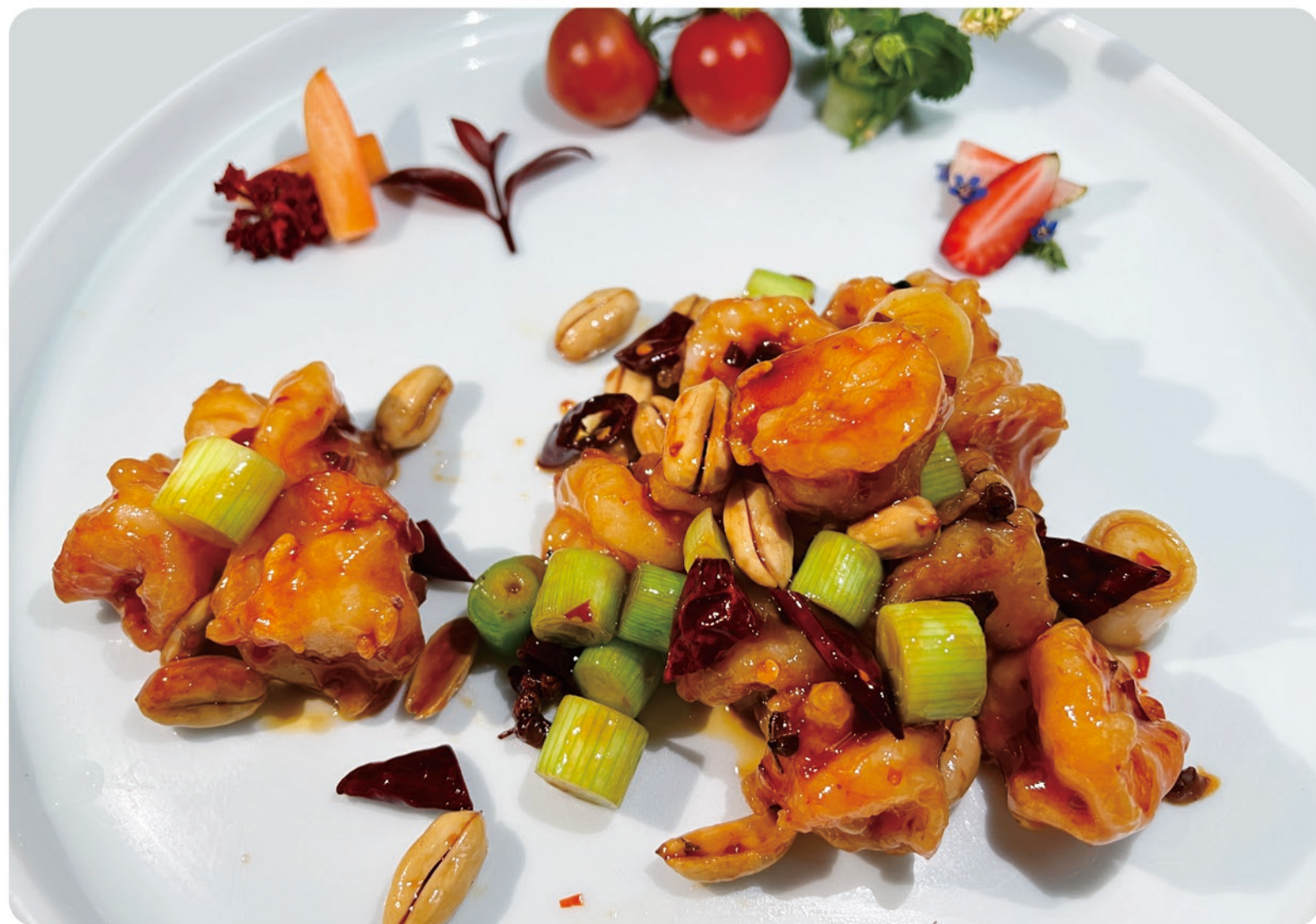
28 GongBao Shrimps 🌶️ €18.80 宫保虾球 虾仁, 大葱, 花生, 干辣椒 Shrimps, Leek, Peanut with Dried Chili