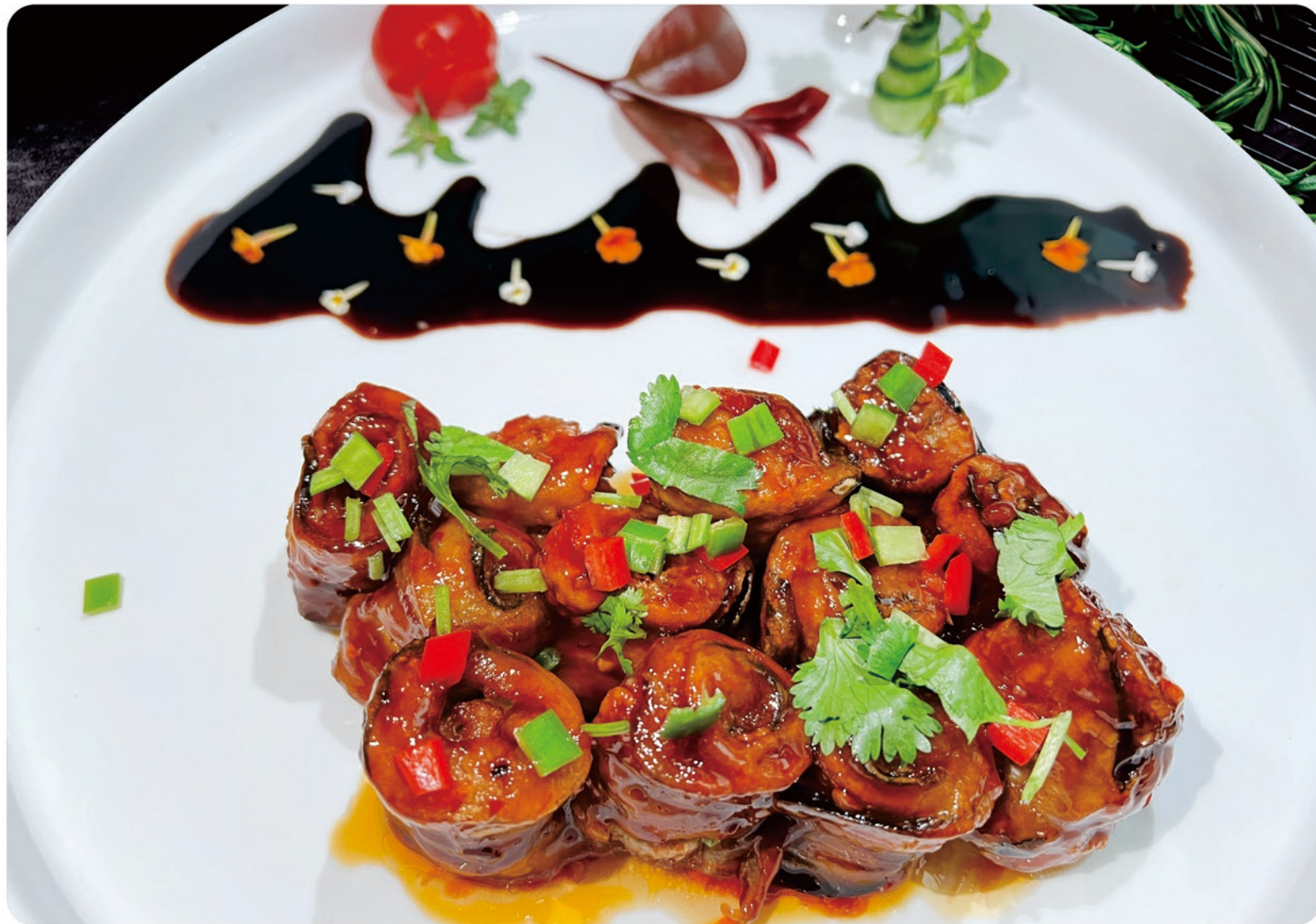
48 Flavored Eggplant (Aubergine) with Fungus in Sweet & Spicy 🌶️ Garlic Sauce 鱼香茄子 €14.80 茄子, 青红椒粒, 香菜 Eggplant(Aubergine), Bell Pepper, with Coriander