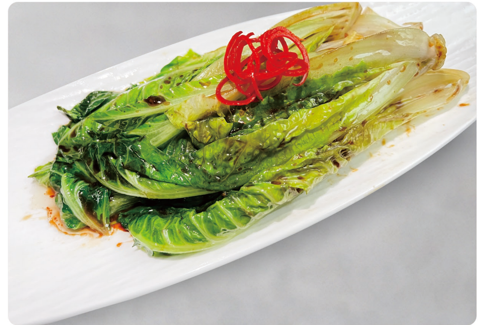
51 Oyster Sauce Lettuces €11.80 蚝油生菜 生菜, 彩椒丝 Lettuces with Bell Pepper