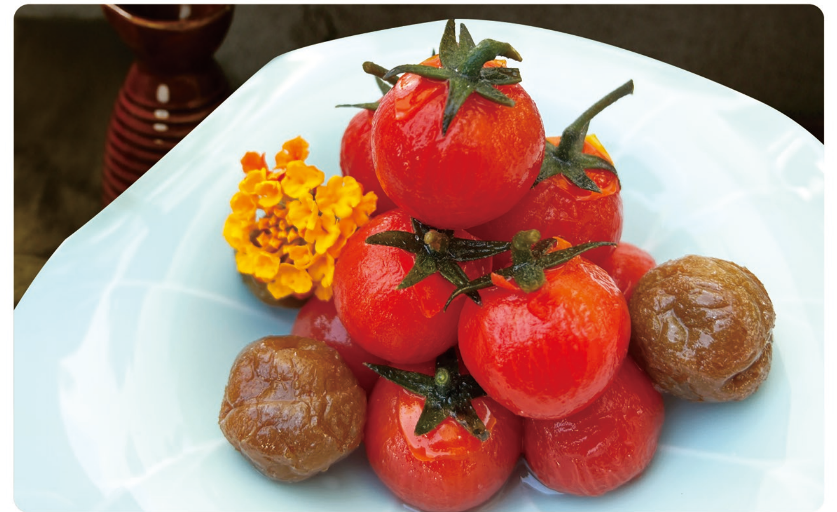
06 Prunes Tomatoes €7.80 西梅圣女果 小西红柿, 话梅 Cherry Tomatoes with Prune