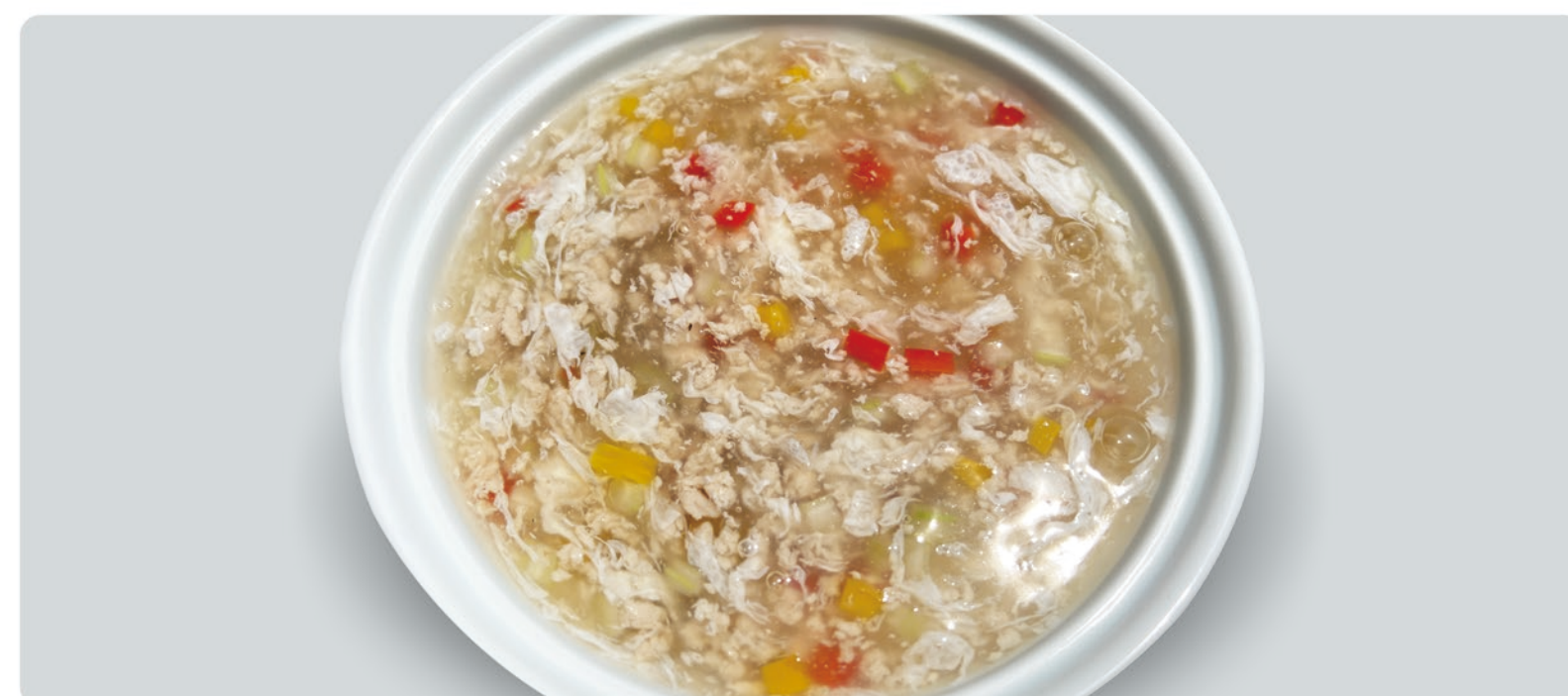
17 West Lake Beef Soup €6.80/份 Portion

玉米, 虾仁, 鱿鱼, 澳带, 鸡蛋 Sweet Corn, Shrimps, Squid, Scallops and Egg