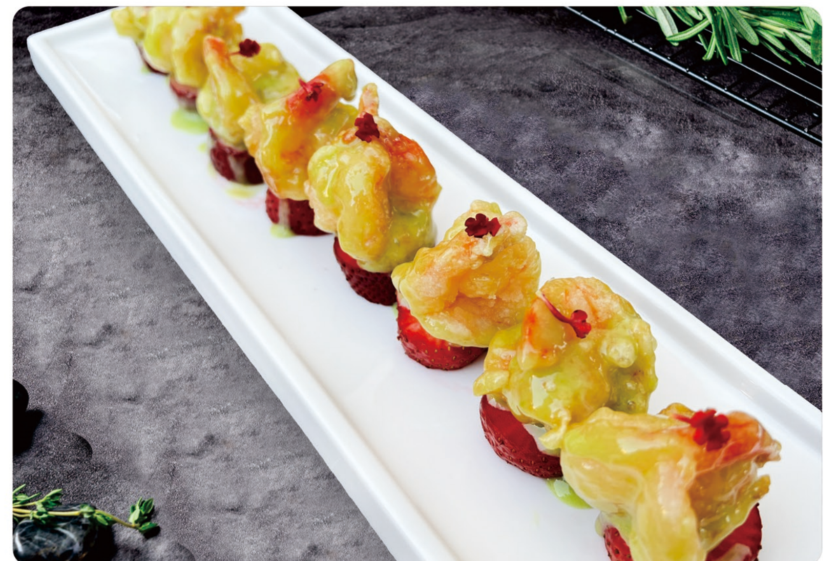
27 Wasabi Shrimp Balls 🌶️ €18.80 芥末虾球 虾球, 草莓 Shrimps with Strawberry