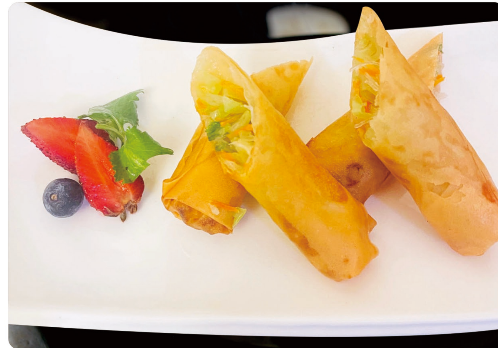
10 Spring Rolls €3.50 春卷 洋白菜, 胡萝卜 Cabbage with Carrots