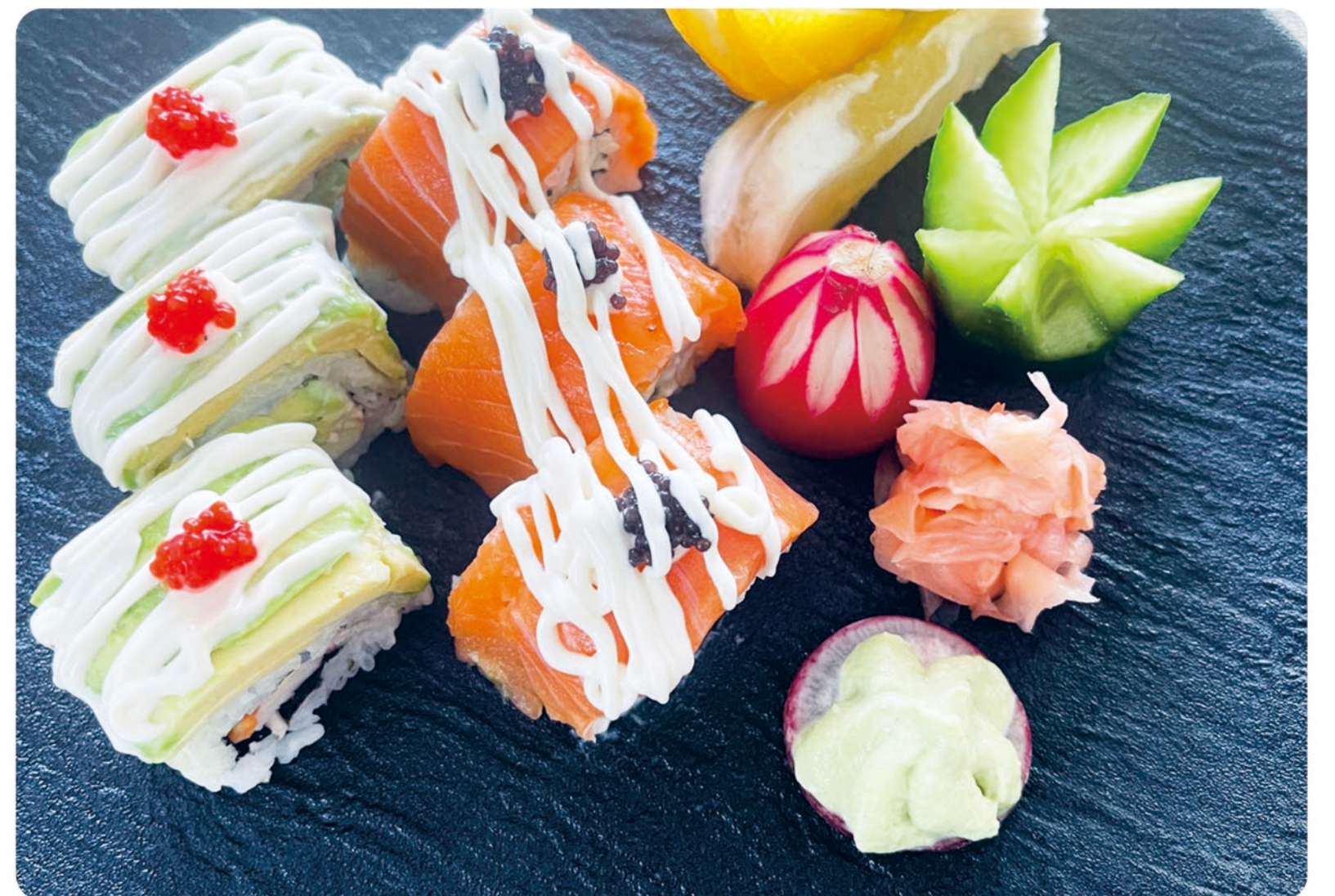
59 Sushi Platter €11.80 寿司拼盘 三文鱼卷, 加利福尼亚卷, 鱼子酱 Salmon Roll, California Roll with Caviar