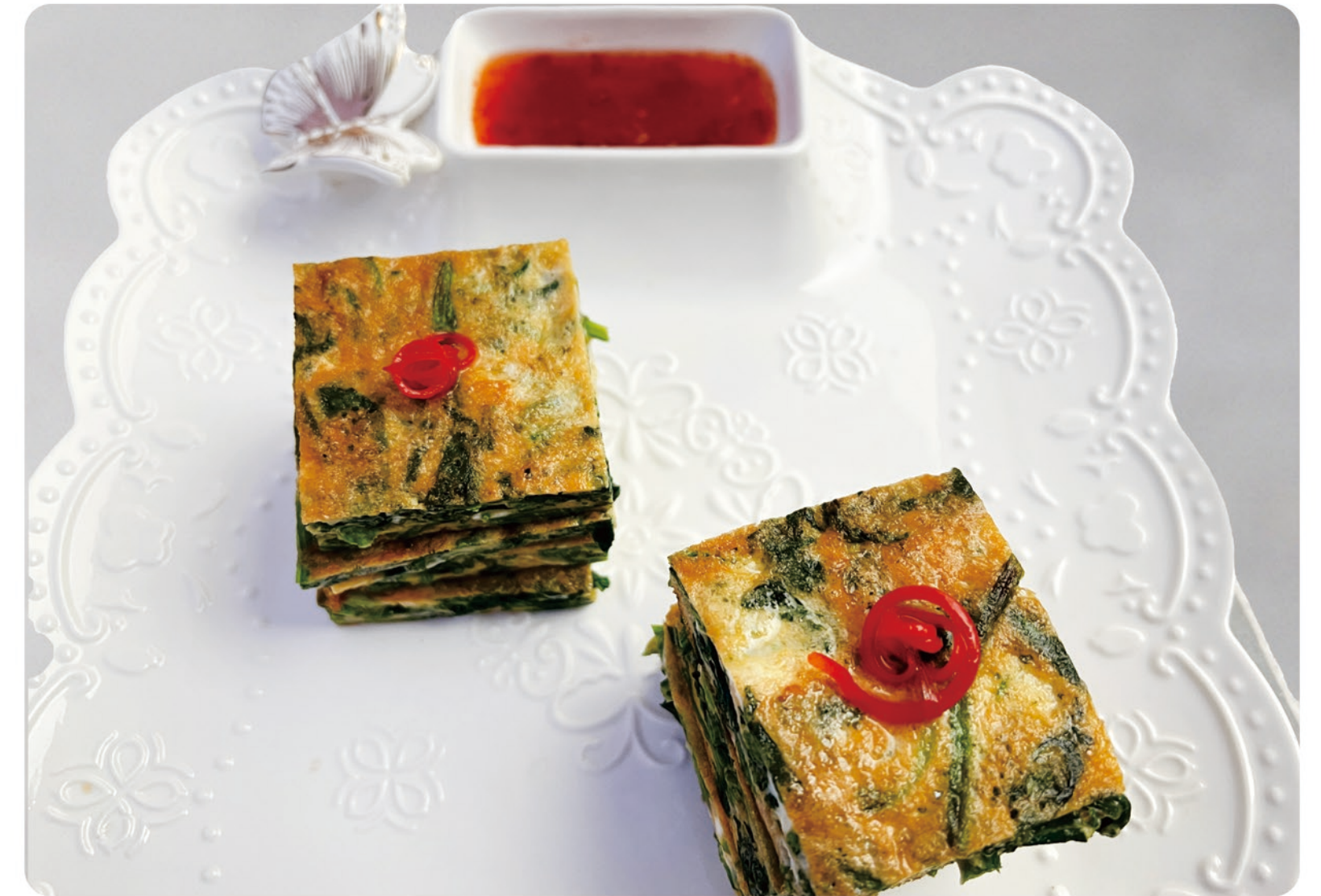
50 Spinach Fried Egg €12.80 菠菜煎蛋 菠菜, 鸡蛋, 甜辣酱 Spinach, Egg with Sweet Chili Sauce