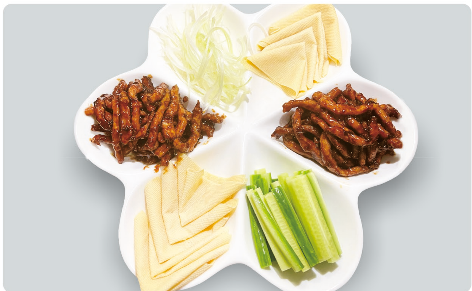
33 Shredded Pork with Beijing Sauce €14.80

猪肉, 彩椒丝, 木耳丝, 胡萝卜丝 Pork, Bell Pepper, Fungus, Carrots