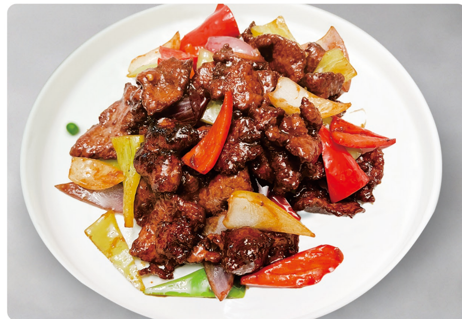
43 Fried Beef Liver €14.80 爆炒牛肝 牛肝, 彩椒, 洋葱, 大蒜 Beef Liver, Bell Pepper, Onion, Leek