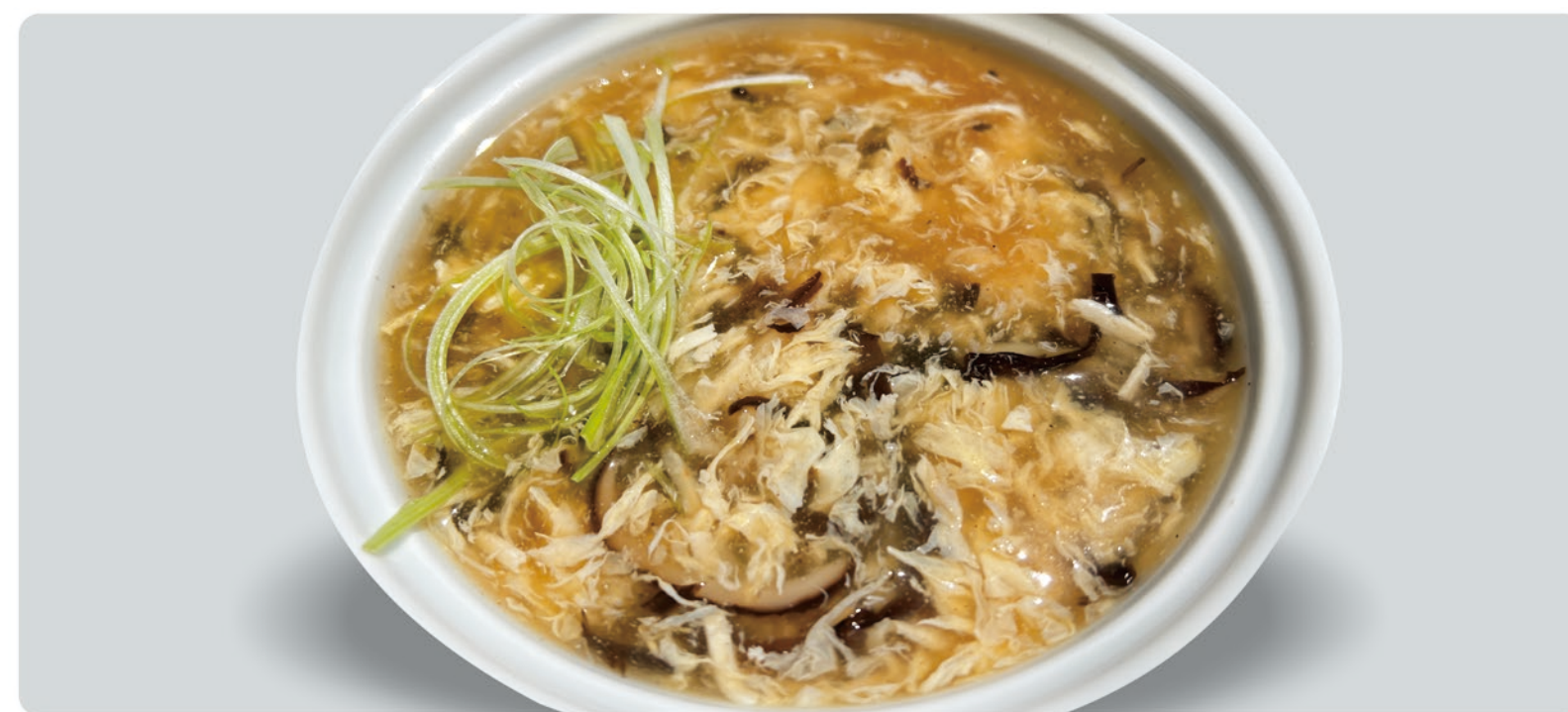
15 Hot and Sour Soup 🌶️🌶️ €3.80/份 Portion