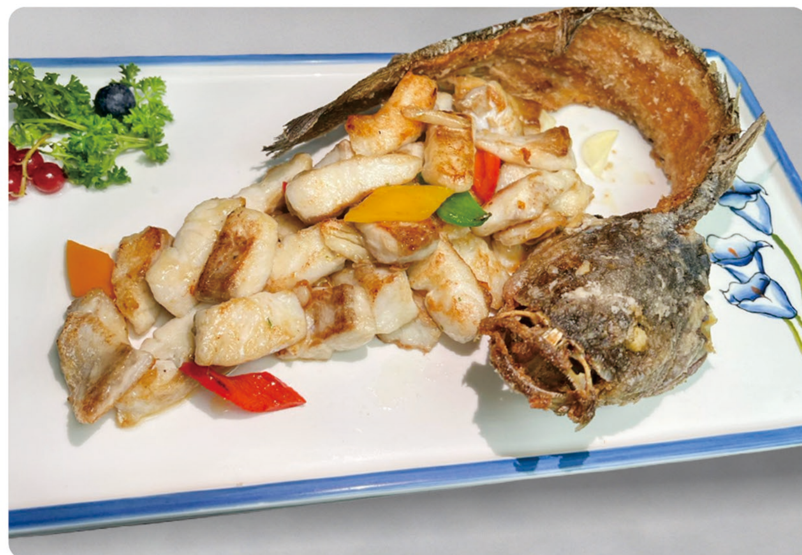
20 Fried Sea Bass €28.80

鲈鱼, 葱丝, 姜丝, 彩椒丝 Sea Bass, Spring Onion, Ginger with Bell Pepper