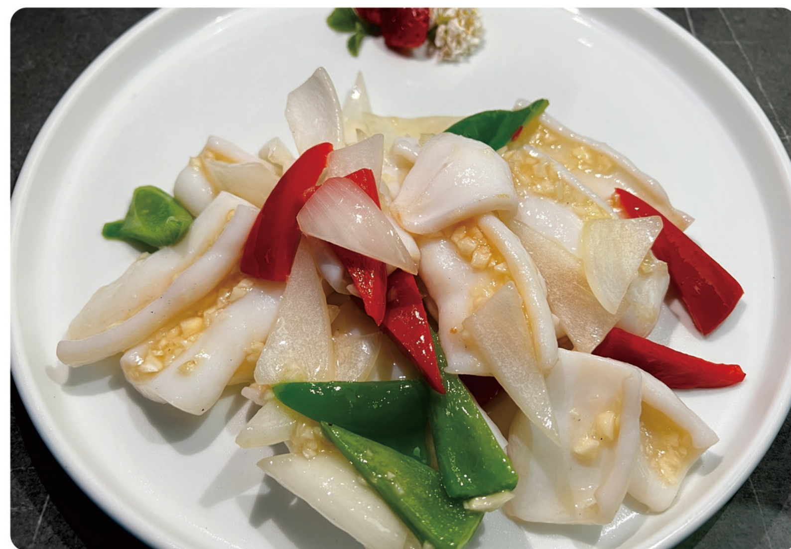
23 Stir-Fried Squid Slices with Garlic €18.80 蒜香爆炒鱿鱼片 鱿鱼, 彩椒, 洋葱, 蒜末 Squid, Bell Pepper, Onion, Garlic