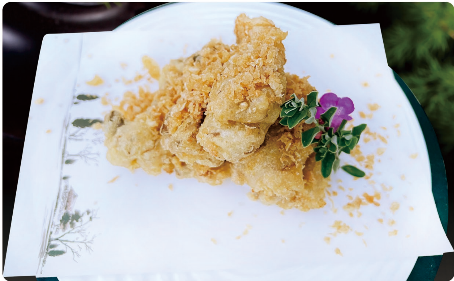
45 Garlic Lamb Ribs €19.80 蒜香羊排 羊排, 大蒜 Lamb Ribs with Garlic