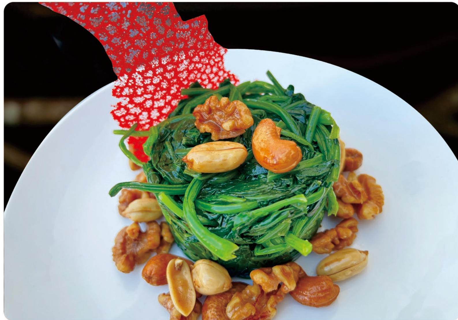
08 Nuts Spinach €7.80 坚果菠菜 菠菜, 坚果 Walnuts, Cashews, Peanuts with Spinach