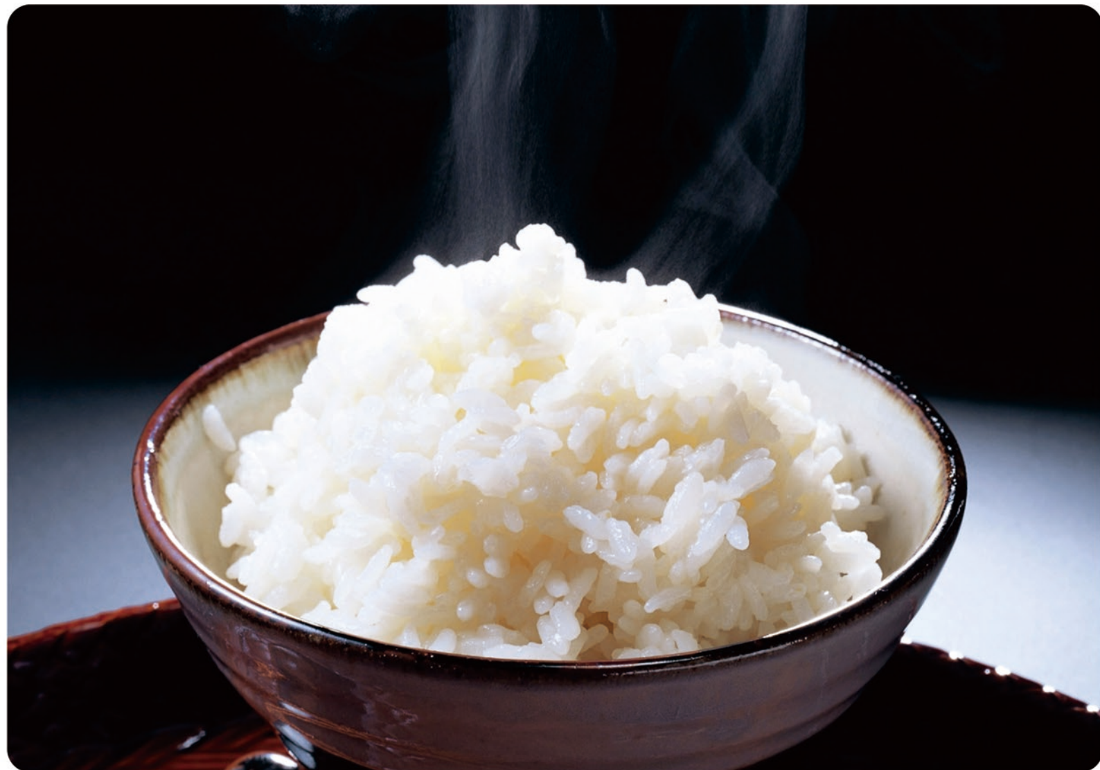
56 Rice €2.00/份 Portion 白米饭 泰国香米 Thai Jasmine Rice