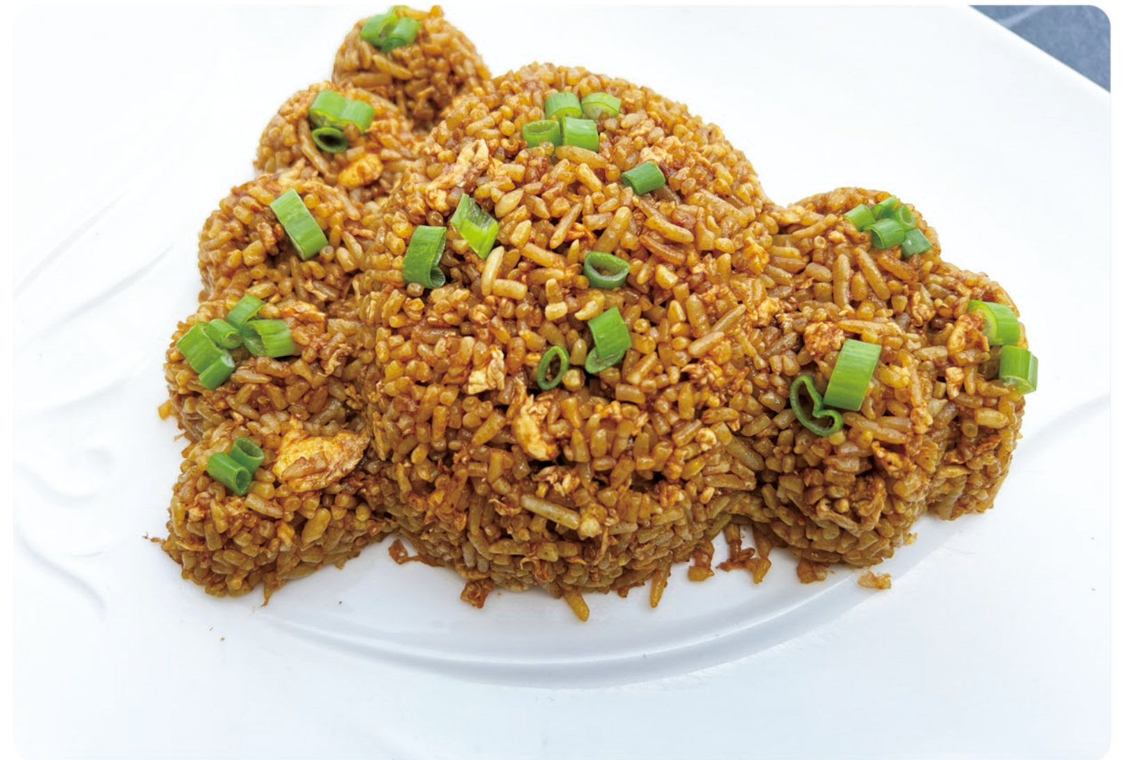
55 Fried Rice with Soya Sauce €8.80

泰国香米, 虾仁, 鱿鱼, 青口贝, 鸡蛋, 蔬菜 Thai Jasmine Rice, Shrimps, Squid, Mussels, Egg with Vegetables