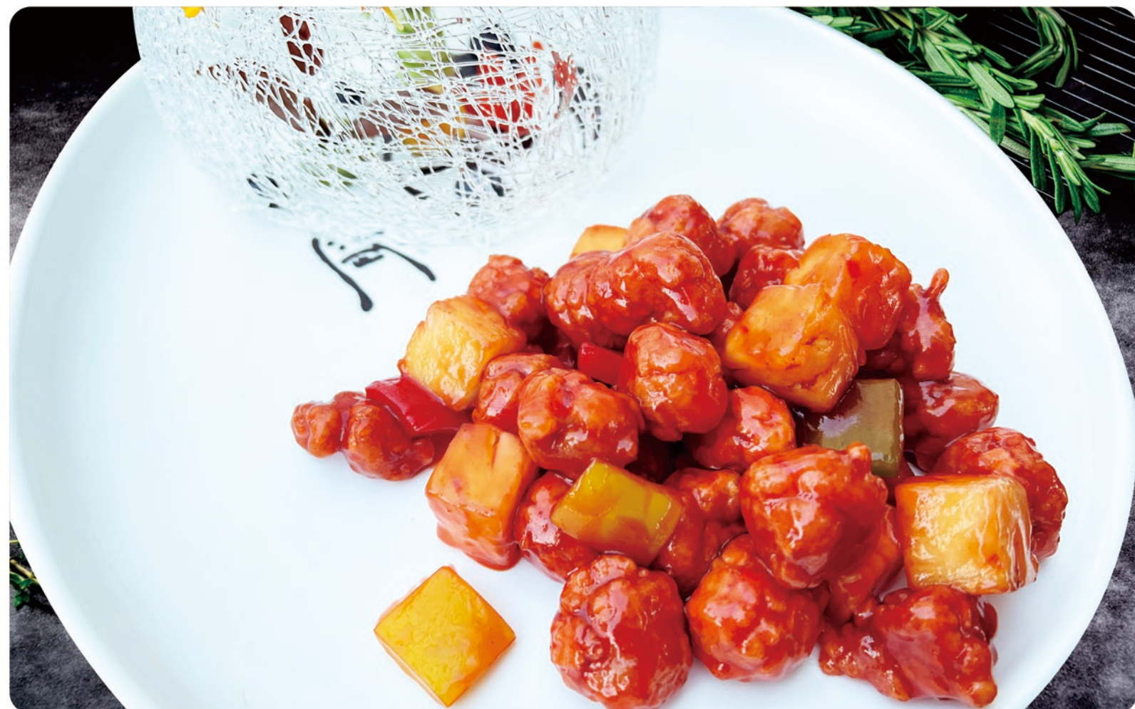
32 Sweet and Sour Pork €16.80