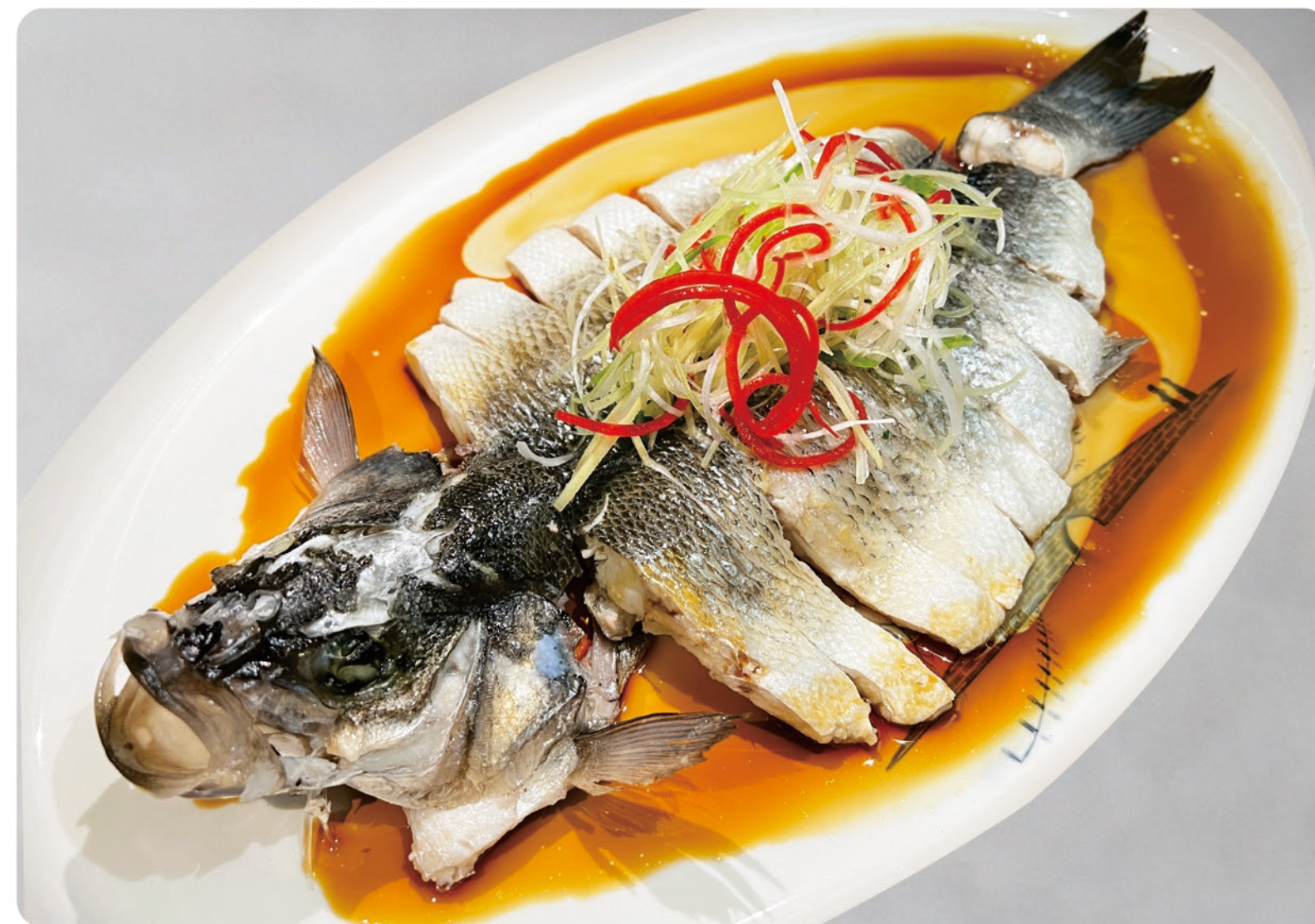
19 Steamed Sea Bass €28.80

龙虾, 粉丝, 塔菜, 蒜蓉 Lobster, Vermicelli, Romanesco Cauliflower with Garlic