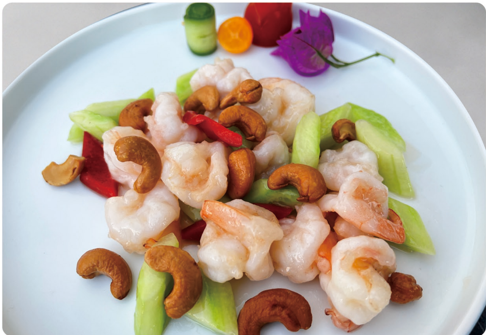
25 Cashews Shrimps €18.80 腰果虾仁 虾仁, 腰果, 黄瓜, 彩椒 Shrimps, Cashews, Cucumber and Bell Pepper