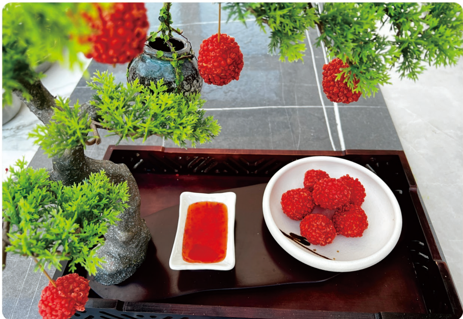
29 Litchi Shrimps €22.80 荔枝虾球 虾球, 甜辣酱 Shrimps with Sweet Chili Sauce