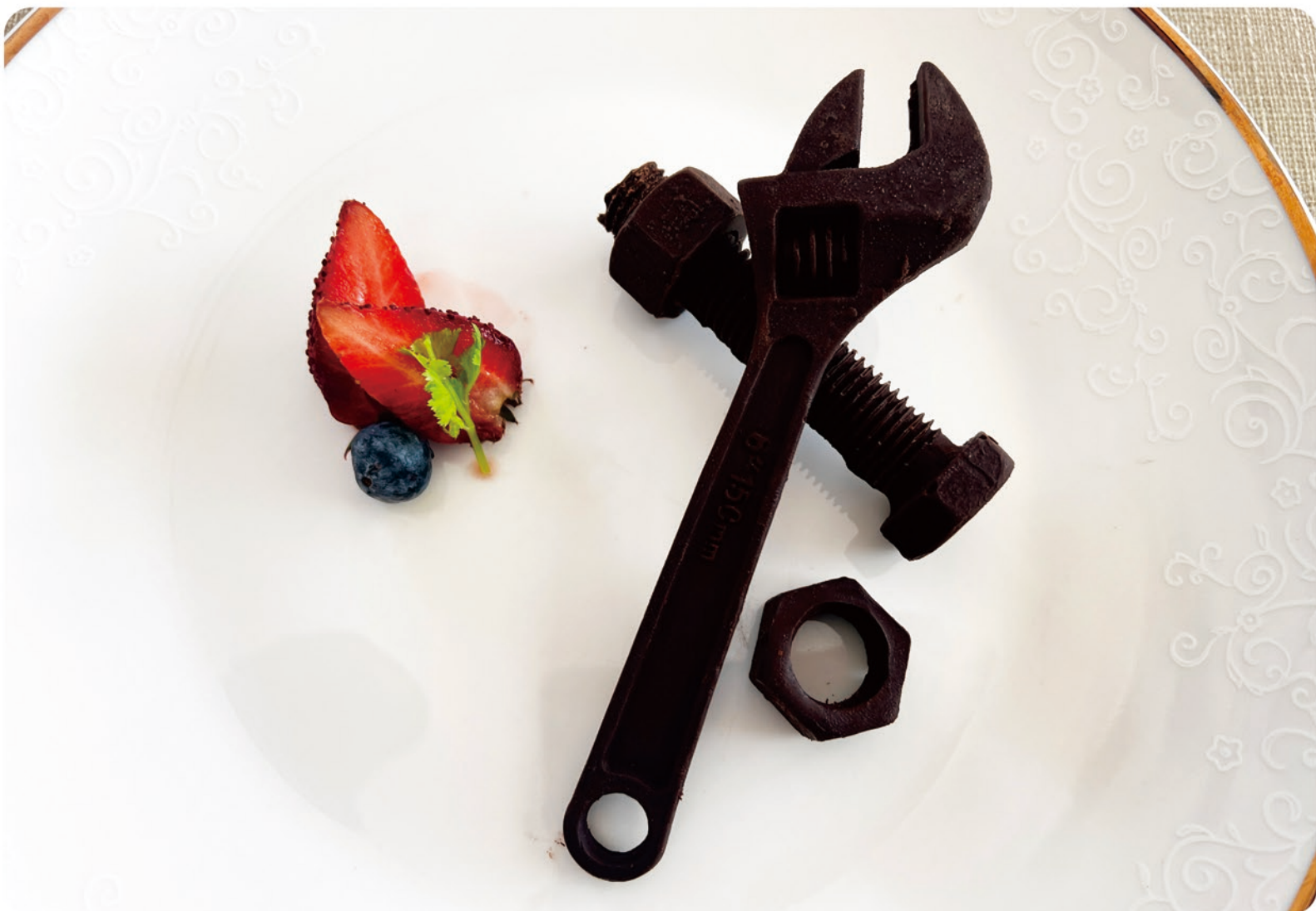
64 Chocolate Screws €5.50 巧克力螺丝 巧克力 Chocolate