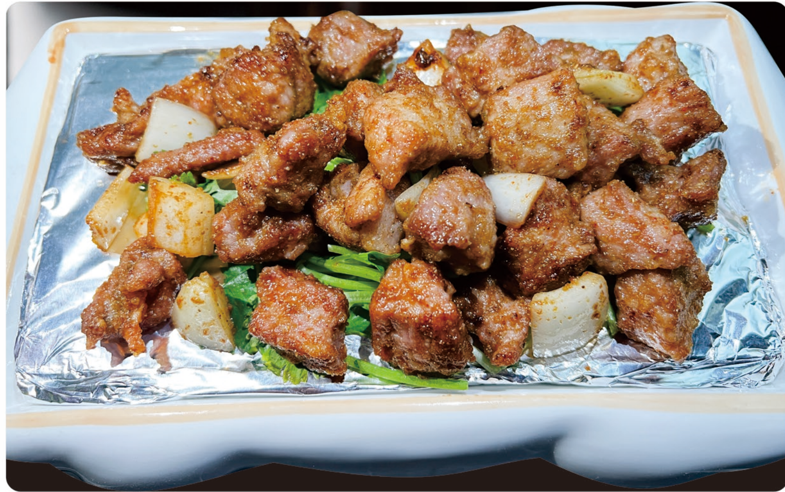
44 Fried Diced Lamb with Cumin 🌶️🌶️ €19.80 孜然羊肉 羊肉, 洋葱, 香菜, 孜然 Lamb, Onion, Coriander, Cumin