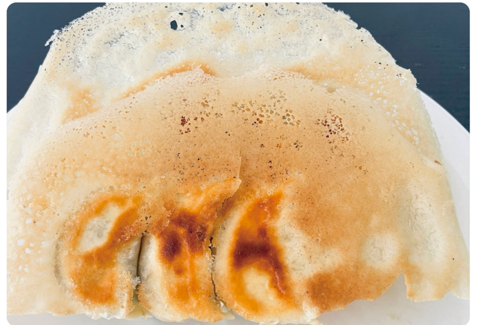
58 Fried Dumplings(Fresh Hand Made) €11.80 传统煎饺(手工现制作) 猪肉馅, 大葱, 姜 Minced Pork, Leek, Ginger