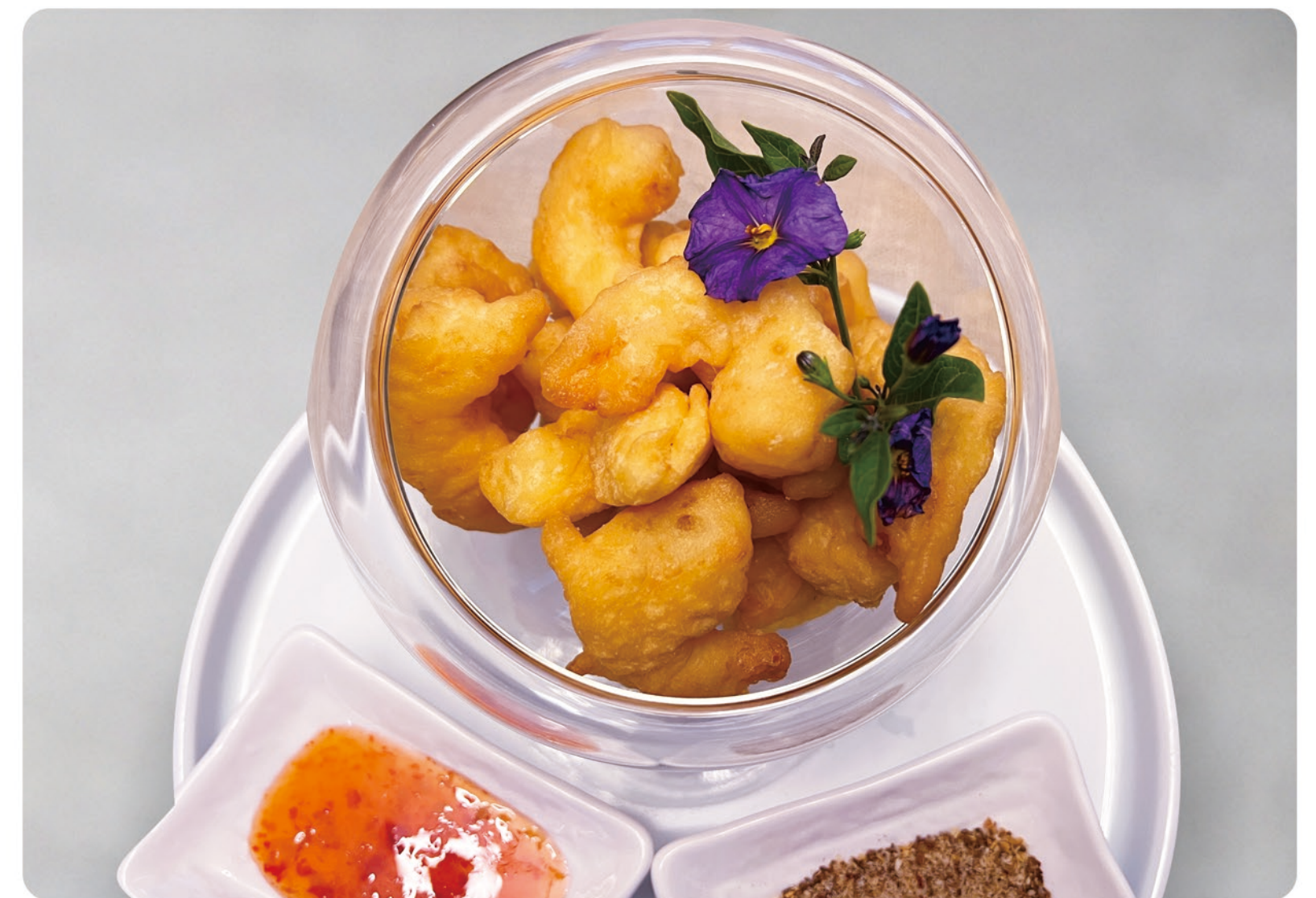
26 Soft Fried Shrimps €18.80 软炸虾仁 虾仁, 椒盐, 甜辣酱 Shrimps, Salt and Pepper with Sweet Chili Sauce