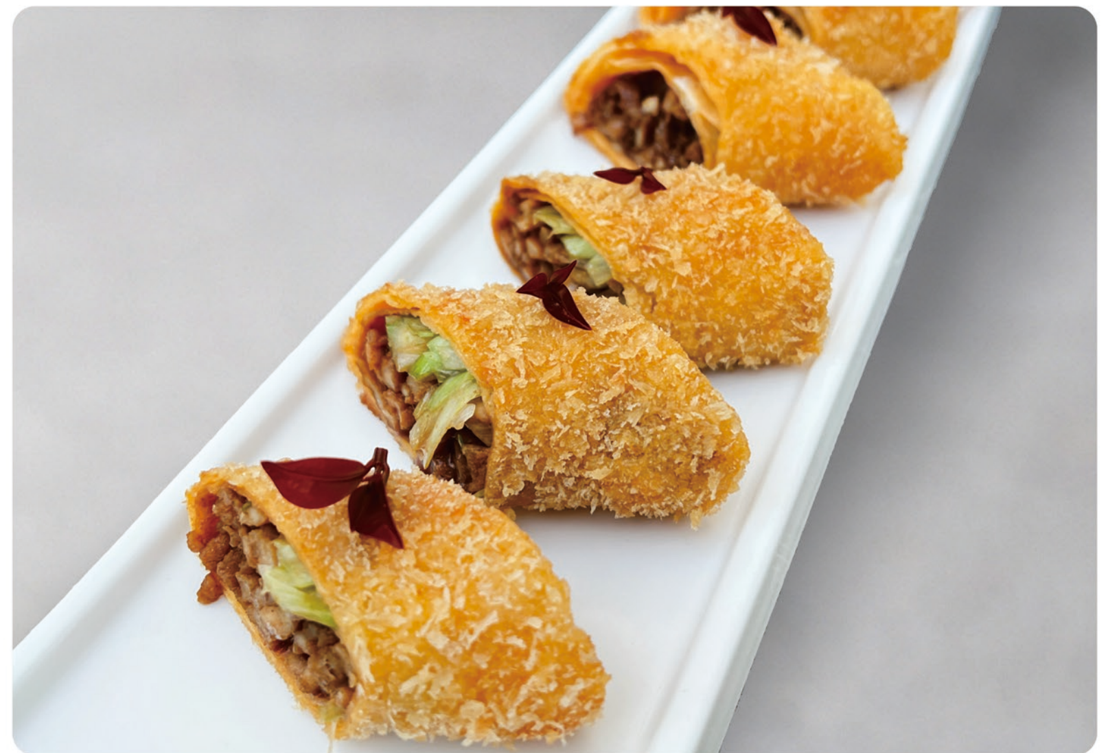
39 Crispy Stripped Chicken Roll €14.80 脆皮鸡丝卷 鸡肉, 大葱 Chicken with Leek