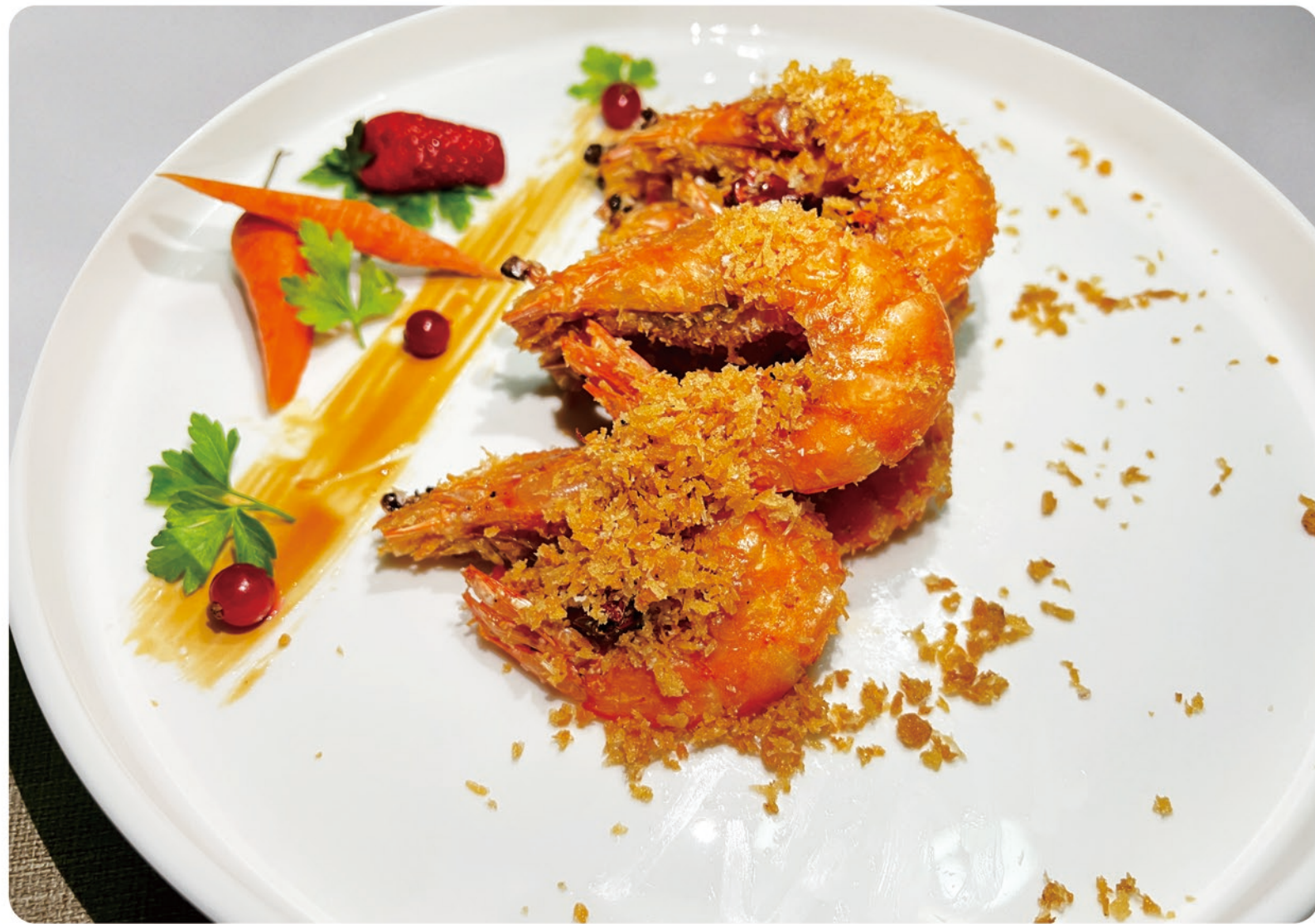
24 Sweet Fried Crispy Prawns 🌶️ €18.80 避风塘脆皮虾 虾, 面包糠, 豆豉, 干辣椒 Prawns, Bread Crumbs, Salted Black Beans, Dried Chili