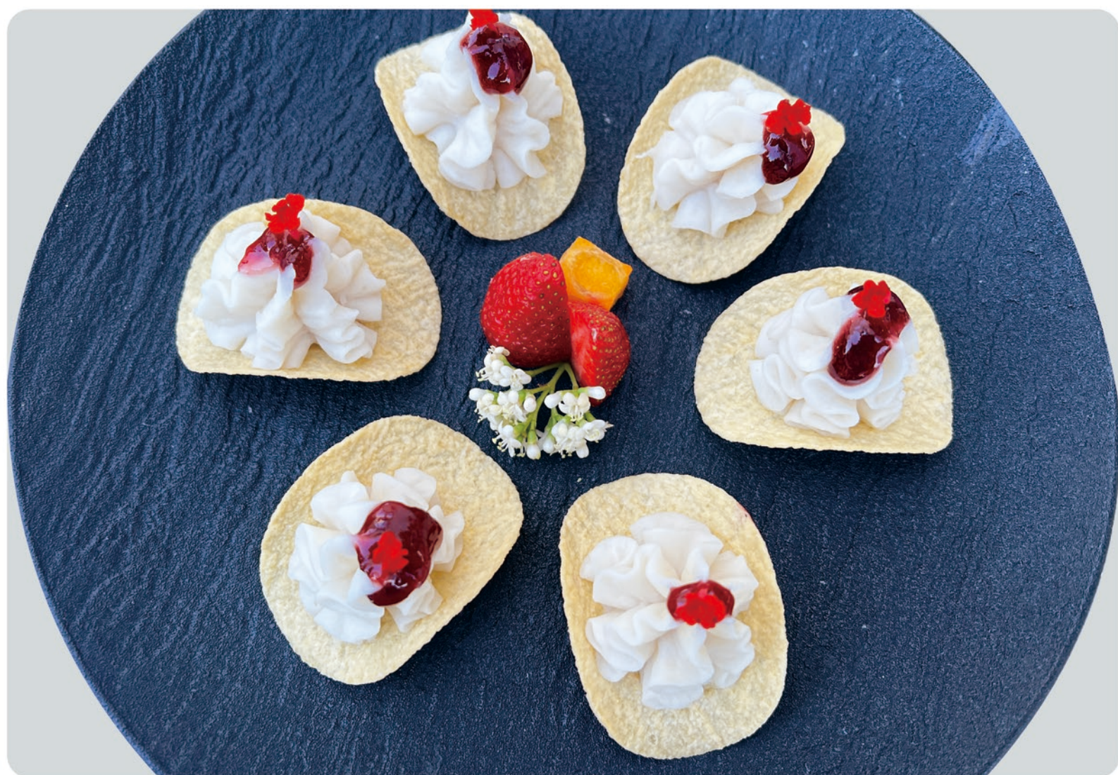
09 Blueberry Taro €6.80 蓝莓山芋 山芋泥, 蓝莓酱 Mashed Taro with Blueberry Jam