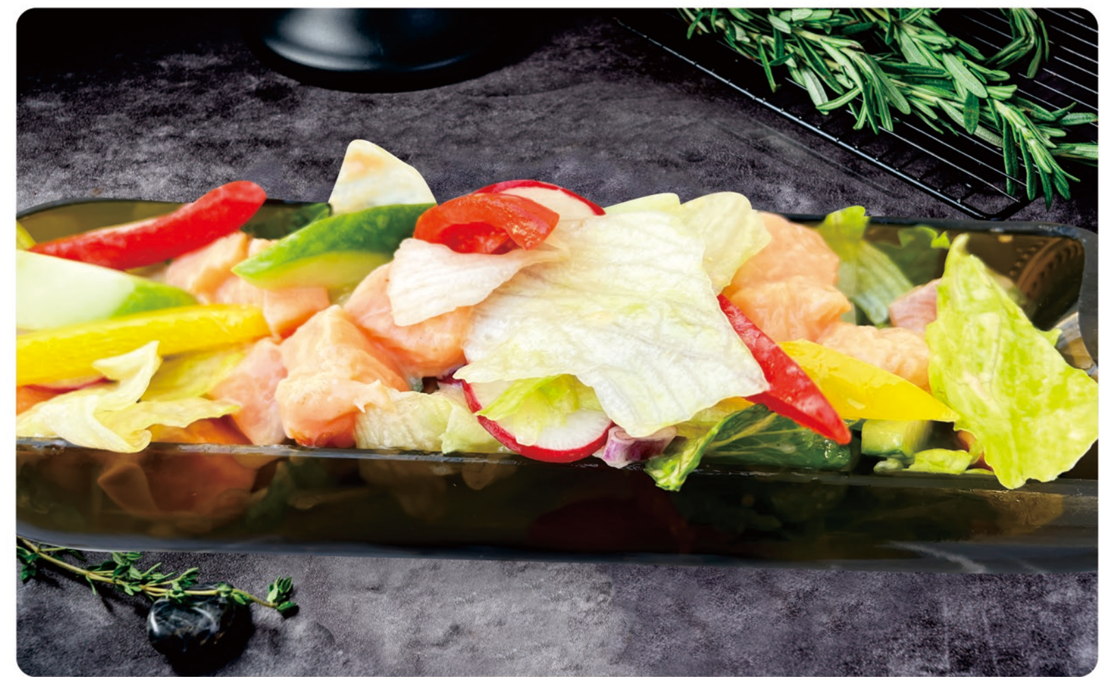
07 Salmon Salad €9.80 三文鱼沙拉 三文鱼, 蔬菜 Salmon with Mixed Vegetables