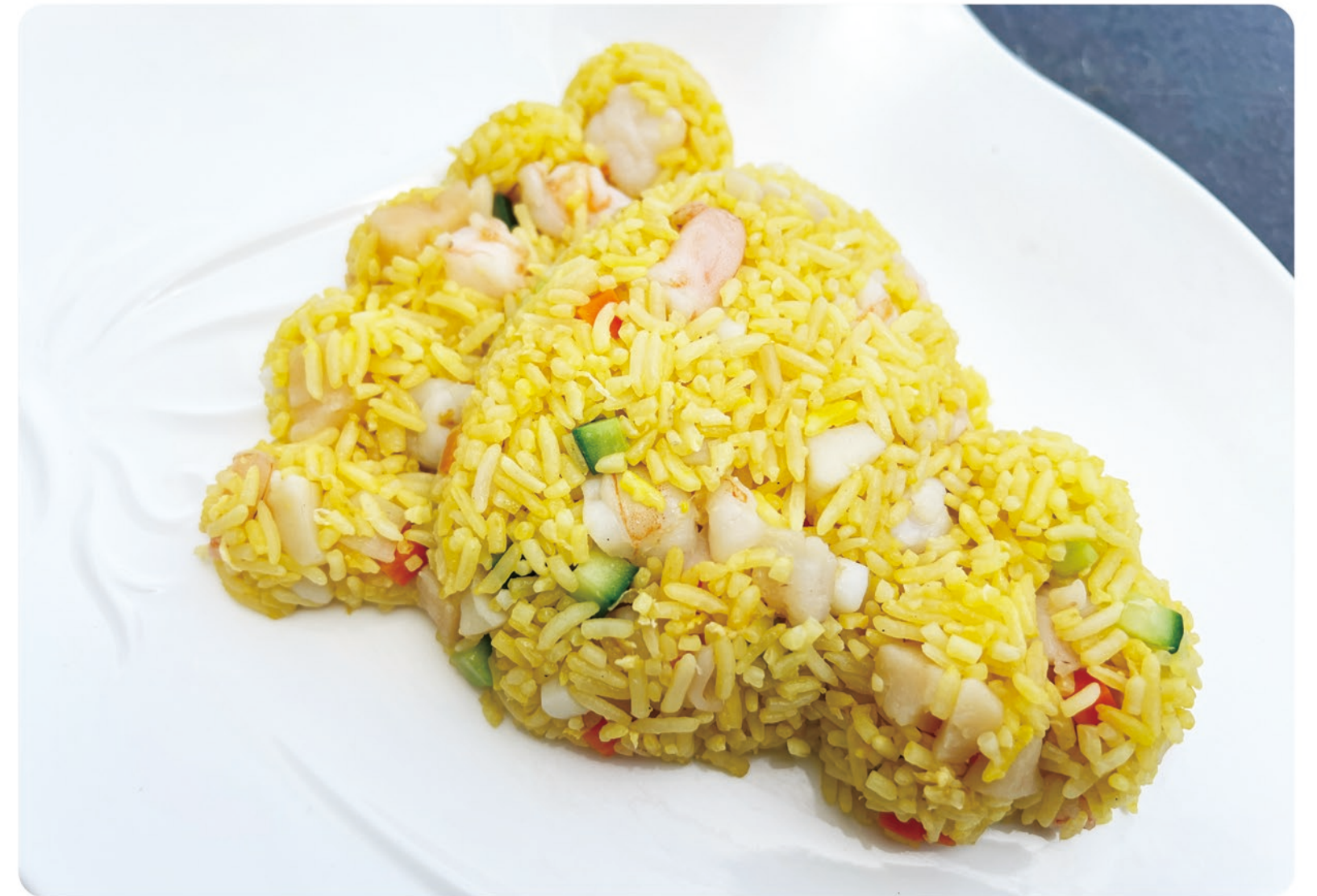
54 Fried Rice with Mix Seafood €14.80