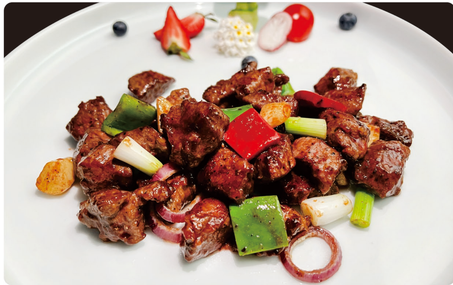
40 Garlic Beef €28.80 黑蒜子牛肉粒 进口肉眼, 彩椒, 洋葱, 大葱, 蒜粒 Ribeye Steak, Bell Pepper, Onion, Leek with Garlic