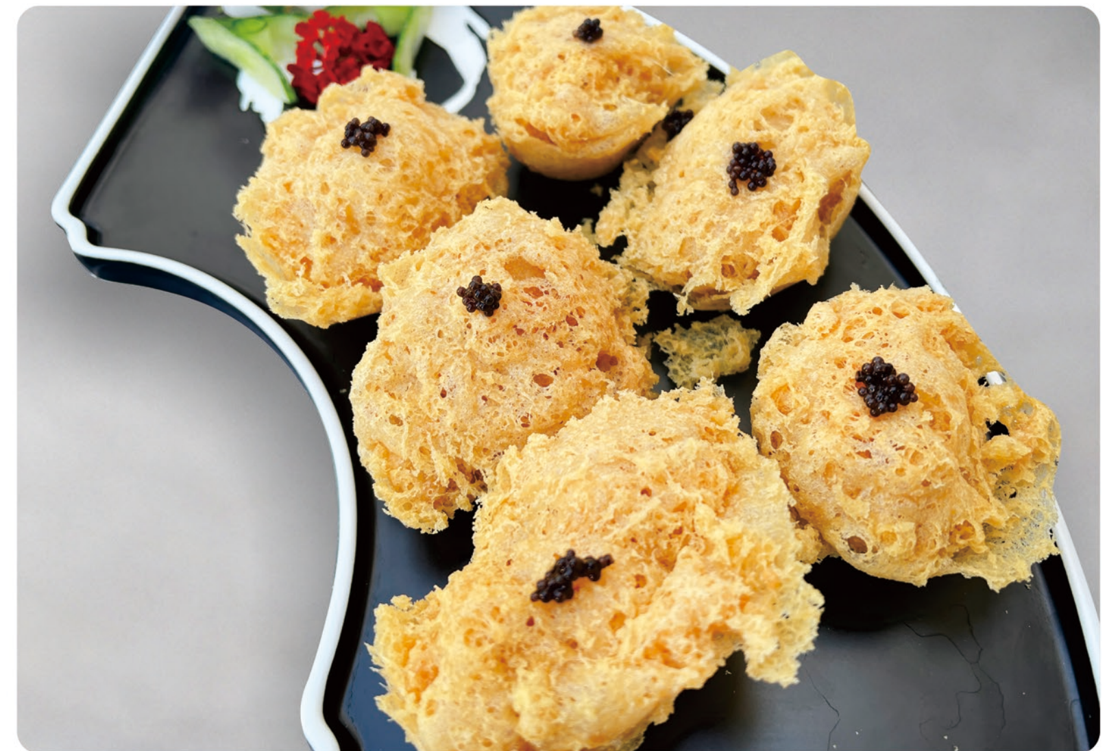
31 Fried Mussels €16.80 酥炸青口 青口, 鱼子酱 Mussels with Caviar