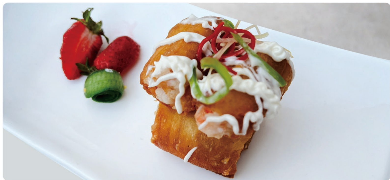
14 Shrimps Stuffed Fritters €11.80