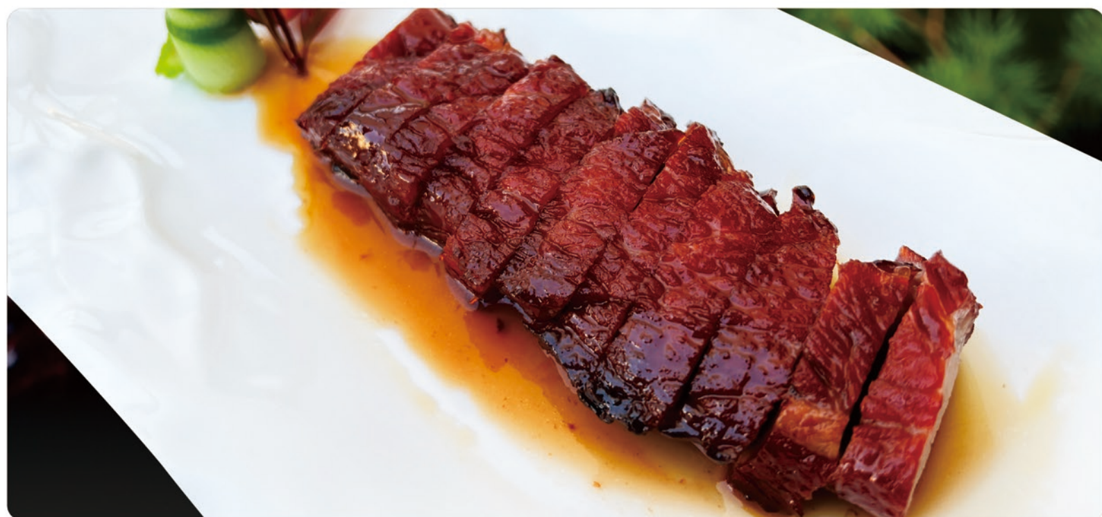
13 Roast Pork with BBQ Sauce €9.80

鸡肉配上葱姜蓉料汁 Served with Onion Ginger Sauce