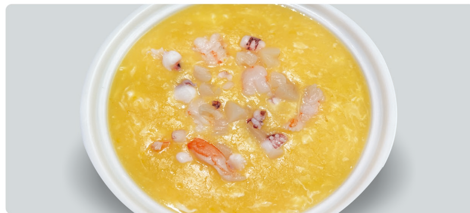
16 Neptune Sweet Corn Soup €7.80/份 Portion

香菇, 木耳, 豆腐, 鸡蛋, 笋丝, 葱丝 Dried Mushroom, Fungus, Tofu, Egg, Shredded Bamboo Shoots, Shredded Spring Onion