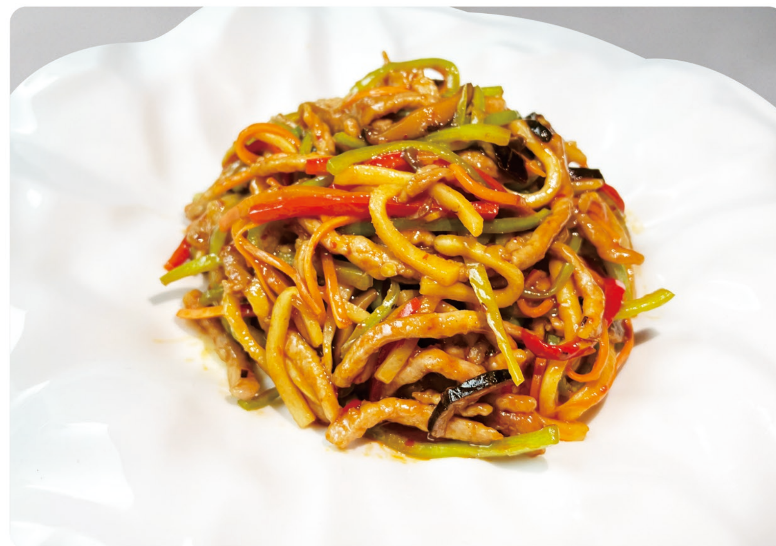
34 Shredded Pork with Fungus in Sweet & Spicy Garlic Sauce 🌶️