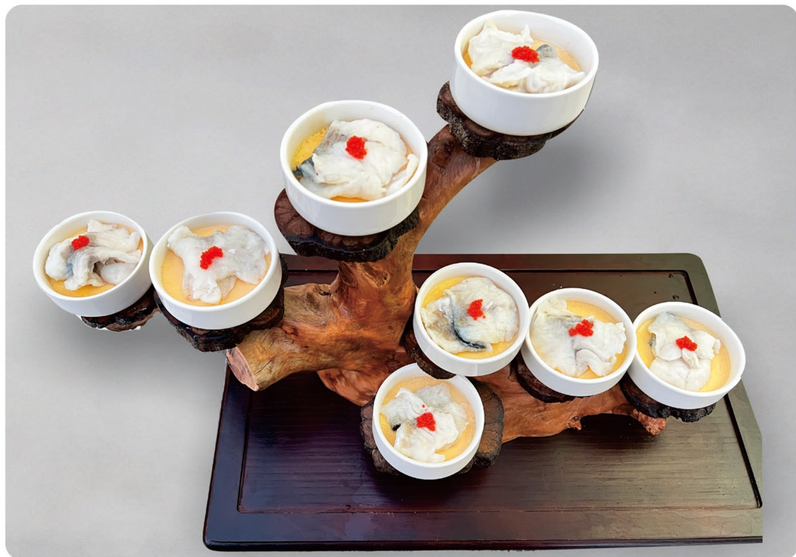
21 Sea Bass on Steamed Egg with Caviar €28.80 蛋底蒸鲈鱼配鱼子酱 鲈鱼, 鸡蛋, 鱼子酱 Sea Bass, Egg with Caviar