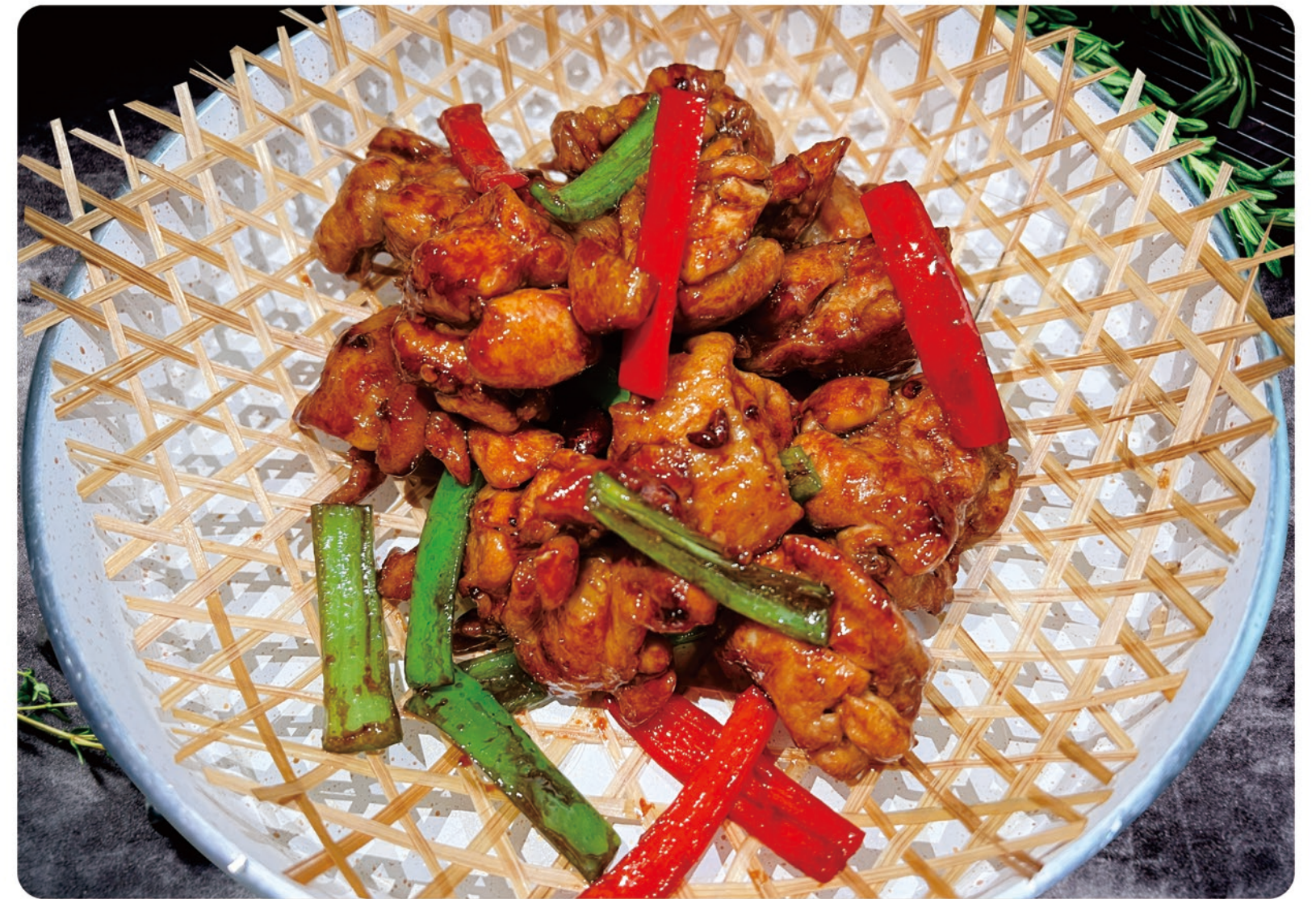
38 Tasty Chicken Wings 🌶️ €16.80 曼妙鸡翅 鸡翅, 香葱, 红线椒, 绿线椒 Chicken Wings, Spring Onion with Red & Green Bell Pepper