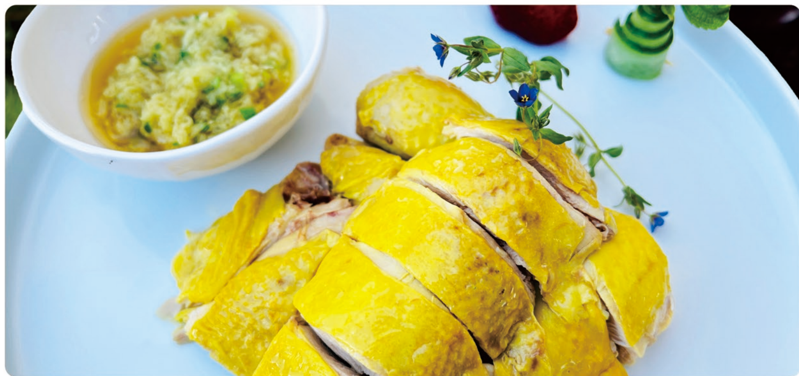
12 Poached Chicken €9.80