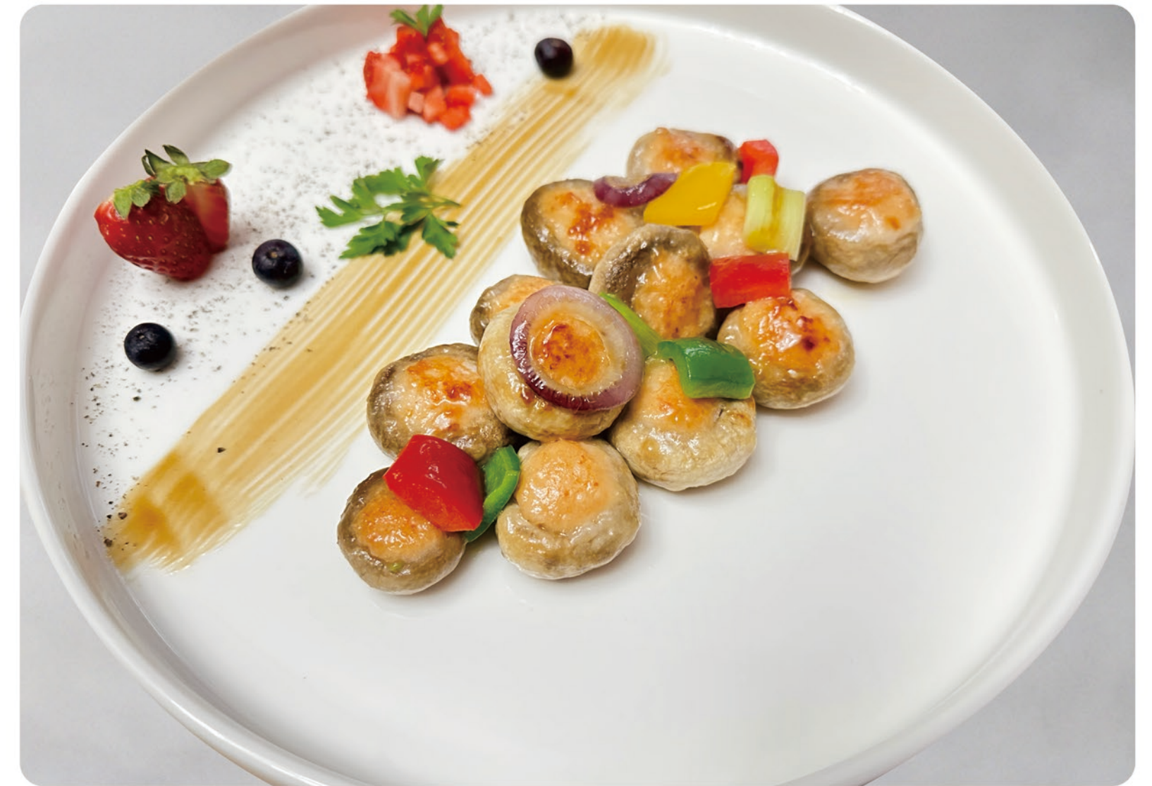
30 Shrimps Mushroom €18.80 鲜虾煎酿口蘑 虾馅, 口蘑, 彩椒 Minced Shrimps, Mushroom with Bell Pepper