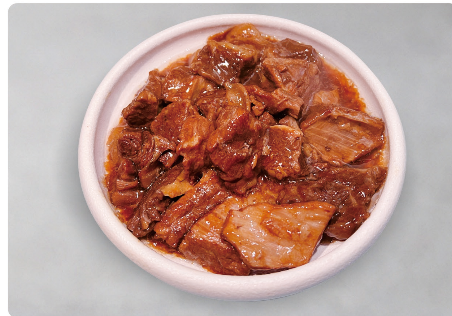
42 Braised Beef with Chinese Herbs €19.80 黄焖牛肉 牛肉 Beef