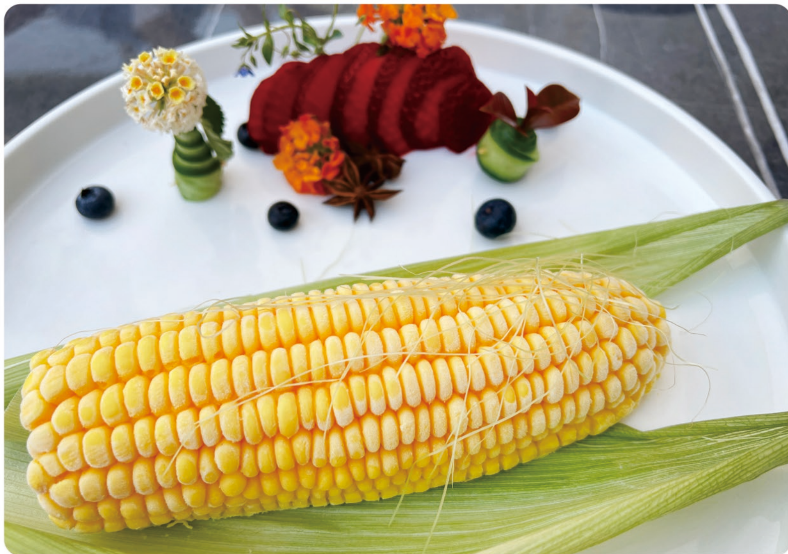
63 Sweetcorn Mousse €6.50 玉米慕斯 黄桃 Yellow Peach