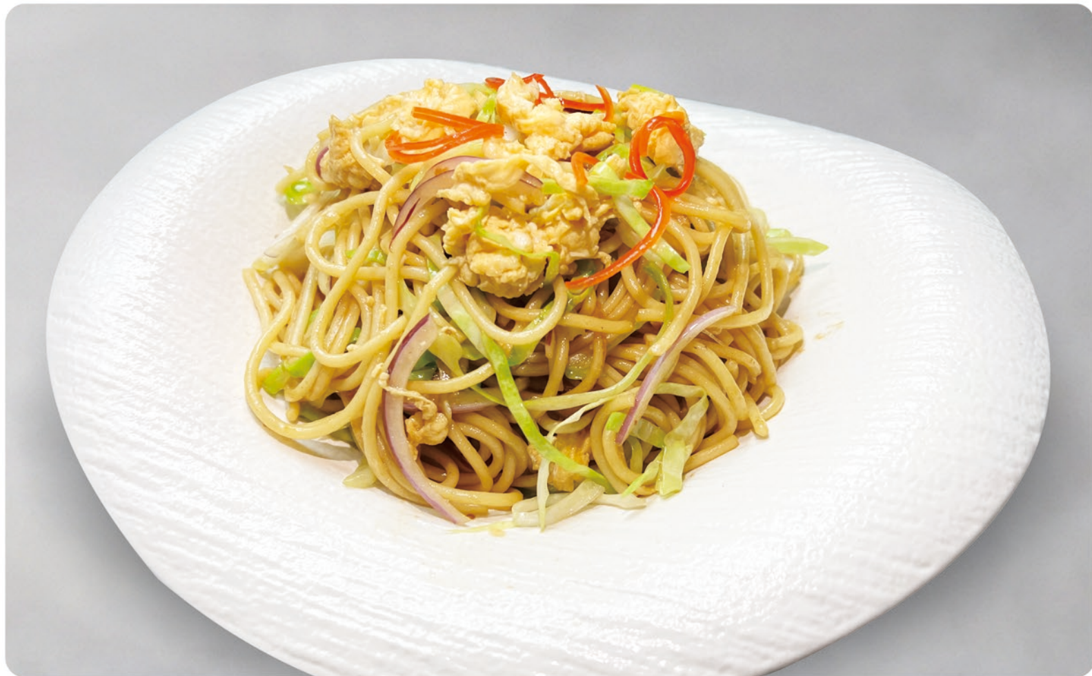
53 Fried Vegetables Noodles €11.80

面条, 虾仁, 鱿鱼, 青口贝, 鸡蛋, 蔬菜 Noodles, Shrimps, Squid, Mussels, Egg with Vegetables