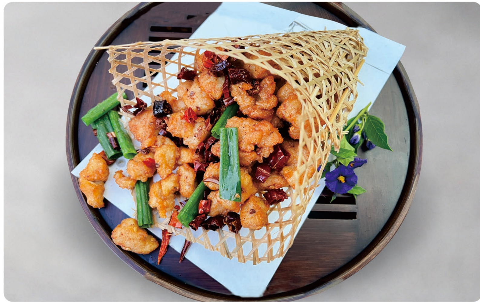
36 Chongqing Spicy Chicken 🌶️🌶️🌶️ €16.80 重庆辣子鸡 鸡肉, 香葱, 干辣椒 Chicken, Spring Onion with Dried Chili