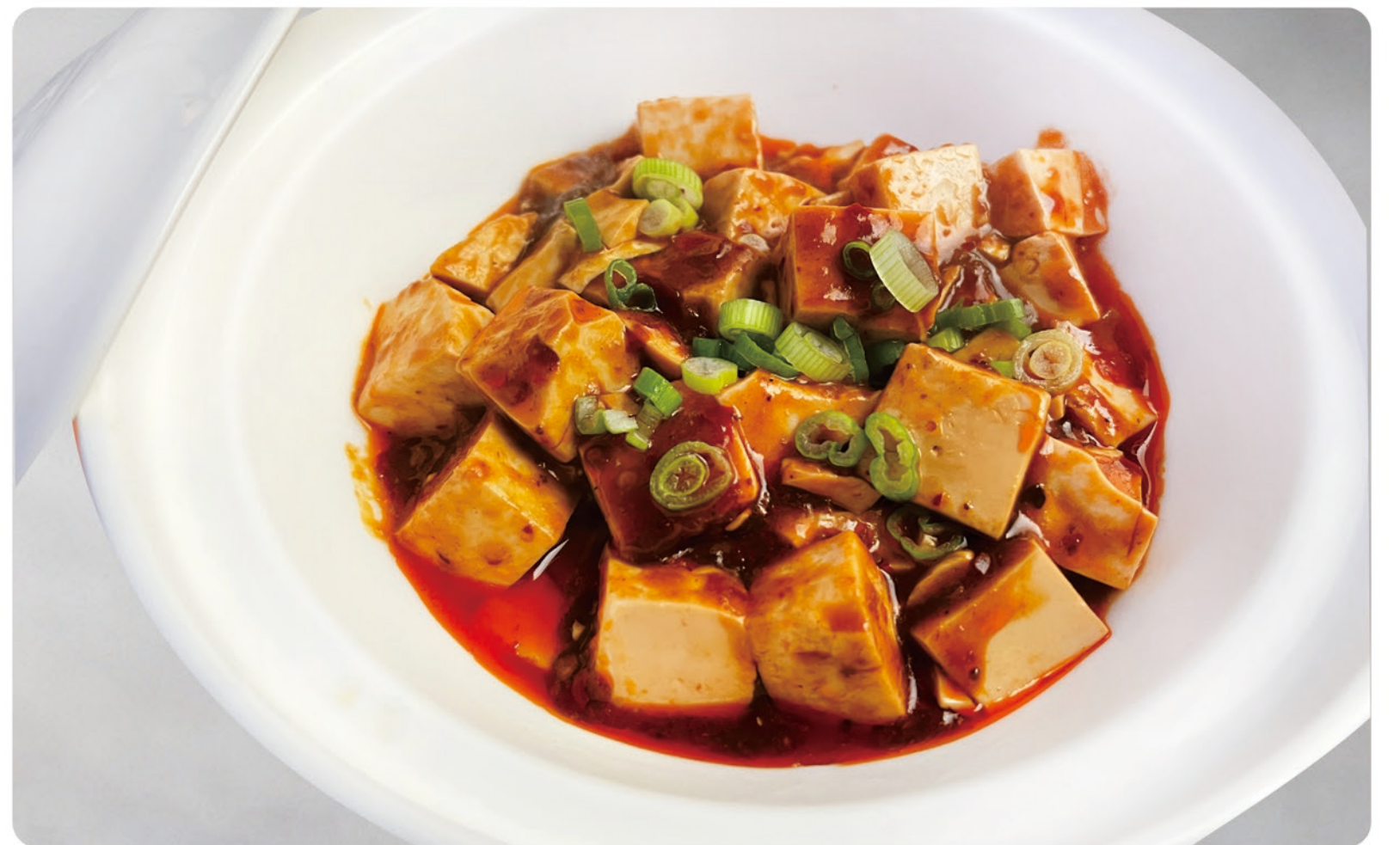
47 Mapo Tofu 🌶️🌶️🌶️ €14.80 麻辣豆腐 豆腐, 大葱 Tofu (Bean Curd) with Leek