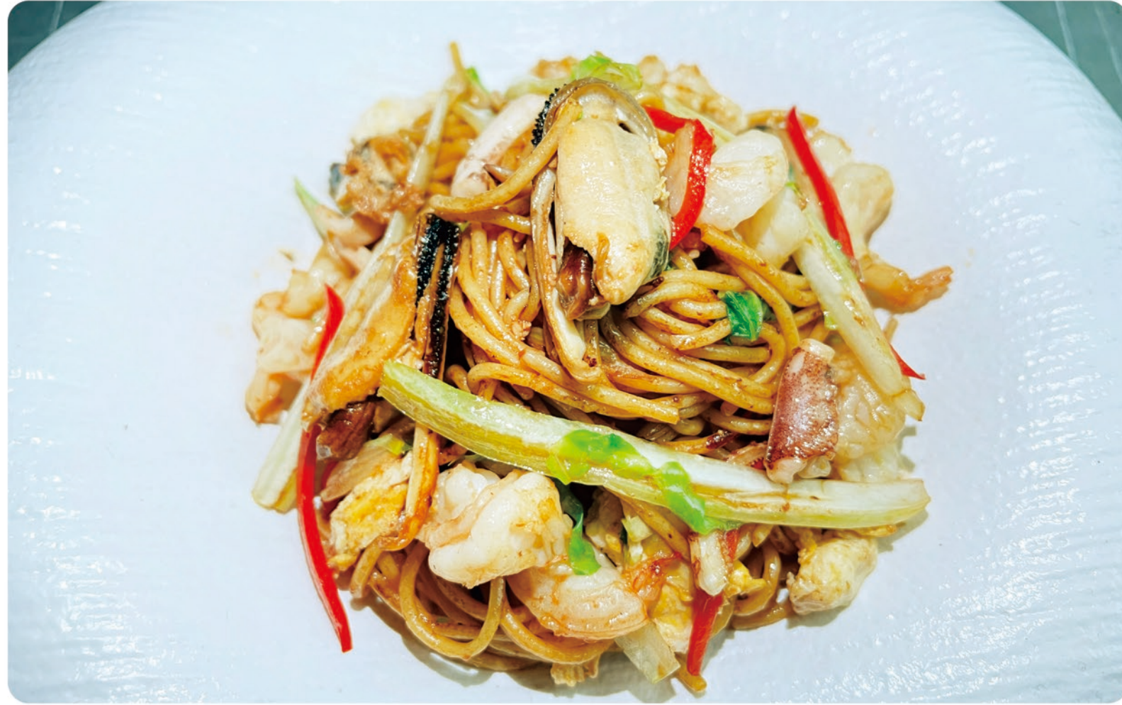
52 Fried Noodles with Mix Seafood €14.80