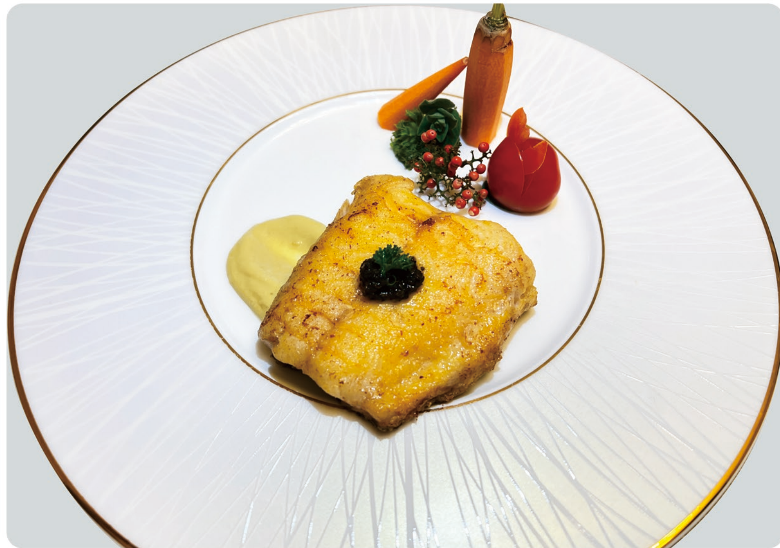
04 Sauté Black Cod with Black Truffle Sauce €24.80 黑松露酱煎银鳕鱼 银鳕鱼 配上黑松露酱 Served with Black Truffle Sauce